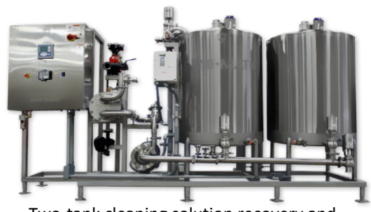
Two-tank cleaning solution recovery and reuse system -Sanimatic

Any facility should audit the performance of its CIP system on a regular basis. But systems that have been in place for many years may benefit from a complete audit provided by a CIP expert.