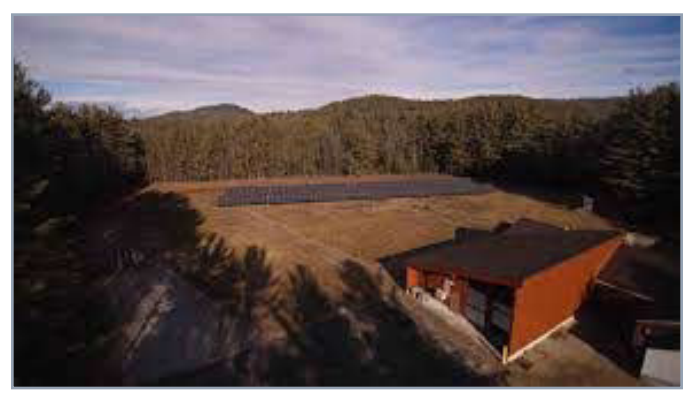
Aerial view of GrandyOats property and solar panels.

MAINE – The Town of Hiram has historically been a center of farming and timber harvesting, while the nearby Saco River provided hydropower for mills. The Hiram Elementary School building was originally constructed in 1979, but in 2008, schools were consolidated in the southern Maine area and the building was abandoned. The former school building drew interest from GrandyOats, an organic granola and food producer local to Maine, because it offered more than 10,000 square feet of single-story space and 8.2 acres of land. In 2017, the Maine Department of Environmental Protection (DEP) used Section 128(a) Response Program funding to provide oversight of the assessment and cleanup of asbestos-containing building materials and underground fuel tanks. After cleanup was completed, GrandyOats redeveloped the property into their new facility in 2018. With support from the U.S. Department of Agriculture's Rural Development program, GrandyOats was able to outfit their new facility with a warehouse for storing raw and organic materials and install 288 solar panels on the school's old sports field. GrandyOats is now the largest employer in Hiram with about 30 staff.