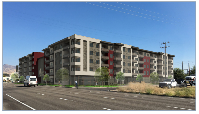
West Fairview affordable housing complex.