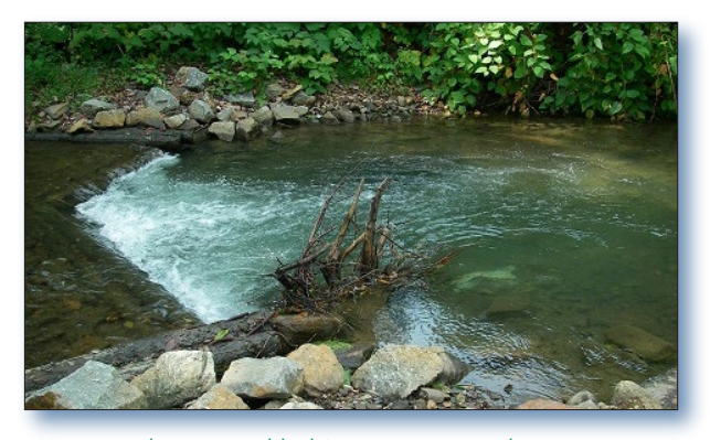
Figure 4. Plunge pool habitat was created.

Community and Economic Development, and PADEP partnered to address the water quality problems in the Upper Schuylkill River watershed. Through 2018, the group was awarded $627,950 from Growing Greener and approximately $2,500,000 from EPA CWA section 319 funds to complete projects in the watershed.