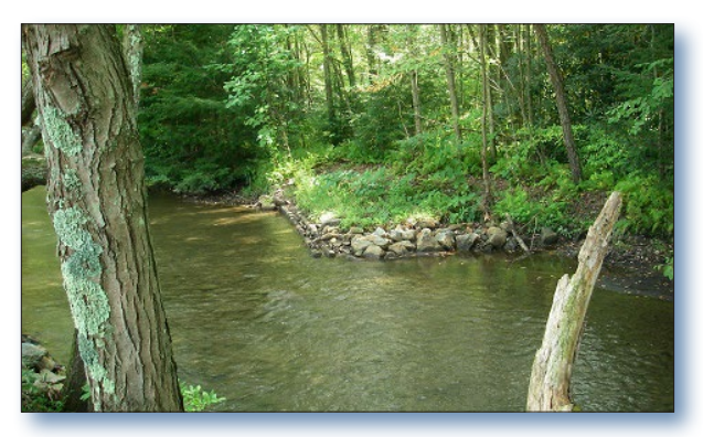
Figure 3. A log framed stone deflector was added.