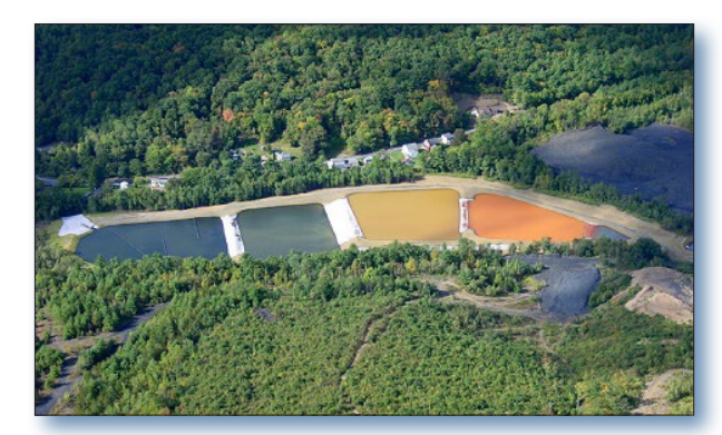
Figure 2. Partners installed an AMD passive treatment system on Silver Creek (a tributary).

Schuylkill Headwaters Association, Schuylkill Conservation District, U. S. Office of Surface Mining, Pennsylvania Fish and Boat Commission, Delaware River Basin Commission, Philadelphia Water Department, the Pennsylvania Department of