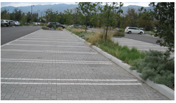
Permeable pavers, Los Angeles Zoo, California

local development code connection, which is essential to building and maintaining a strong local LID program.