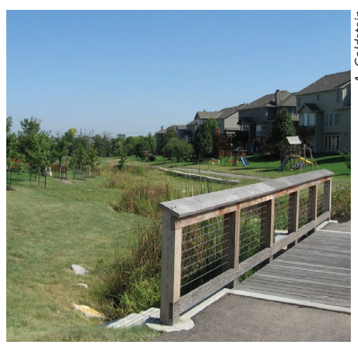
A trail winds through neighborhood parkland, Lenexa, Kansas