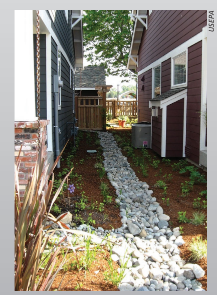
Zoning code allows for LID practices and limited setback between homes, Seattle, Washington