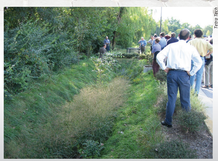
Visitors learn about a roadside rain garden from experts at the University of Maryland, College Park