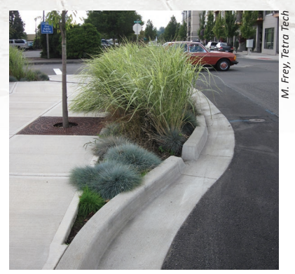
Curb bump-out creates narrower streets and captures runoff, Gresham, Oregon

A great way to increase the use of LID in your community is to revise your stormwater ordinance to include a retention requirement or volume control requirement; to meet the requirement, the developer would need to use some type of LID or hybrid LID plus traditional stormwater practices.