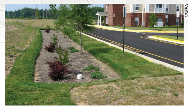
Stormwater infiltration trench, Stafford County, Virginia

A growing number of municipalities are reviewing their development codes to identify and remove obstacles to LID, including places such as Raleigh, N.C.; Alpharetta, Ga.; San Antonio, Texas; and Phoenix, Ariz. Using tools such as guidebooks, checklists and other resources, diverse communities across the country are working to make the LID–