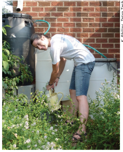
Rain barrels provide water for garden and landscape plants, Mt. Crawford, Virginia

When communicating the benefits of revising development codes, it's a good idea to help stakeholders understand how the codes evolved and why they contain the requirements they do. Local codes are complex tools that were developed by communities over many decades to meet different local departments' operational needs or local government objectives. Changing the local code to promote or require LID isn't easy when it conflicts with other core goals or needs. To be successful, LID code revision efforts must consider other community goals, core departmental functions and development needs. Crafting proposed code revisions will require input and negotiations from multiple local government programs or divisions as well as representatives from the development and design community, homebuilders' associations, environmental groups and other key community stakeholders.