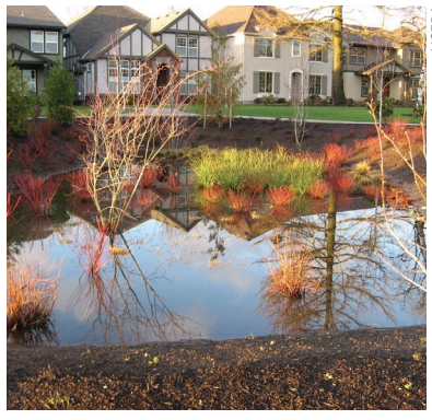
Development includes open spaces and decentralized stormwater control, Wilsonville, Oregon