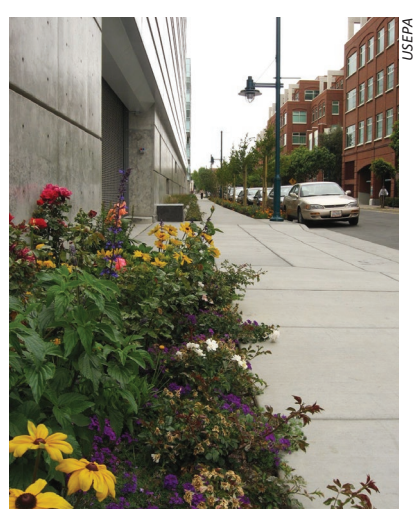
Stormwater planters capture roof runoff and add beauty to an urbanized area, Emeryville, California