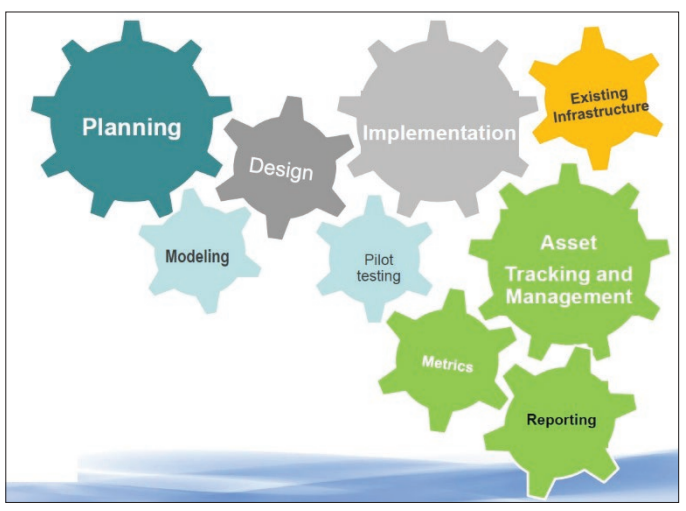
Building and maintaining a LID program requires cooperation and coordination between local government and community stakeholders