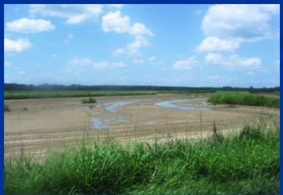
South central Louisiana lands before flooding