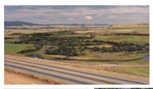
Reach A: Deer Lodge Valley, View from Garrison looking upstream.

DEQ will conduct extensive monitoring within the Clark Fork River as they implement the cleanup. The U.S. Geological Survey (USGS) also conducts monitoring at