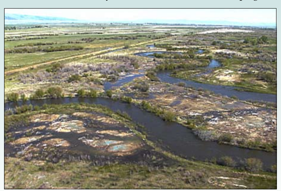
Overland runoff from exposed tailings and impacted soils, upper Clark Fork River, 1997.