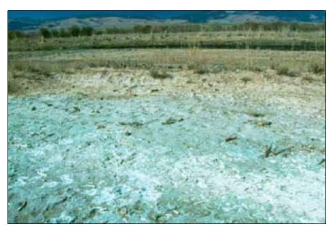
Slickens areas are exposed tailings that are devoid of vegetation.

In 2005, the United States (through EPA) began negotiations with AR for remedy implementation and resolution of interim costs (past costs prior to 2004 were settled in a prior Consent Decree). The discussions also included response and natural resource damage (NRD) claims by DOI for the Grant-Kohrs Ranch National Historic Site (a unit of the National Park Service), and 15 parcels of land managed by the Bureau of Land Management (BLM). At the same time, the State of Montana initiated discussions with AR for settlement of its remaining NRD