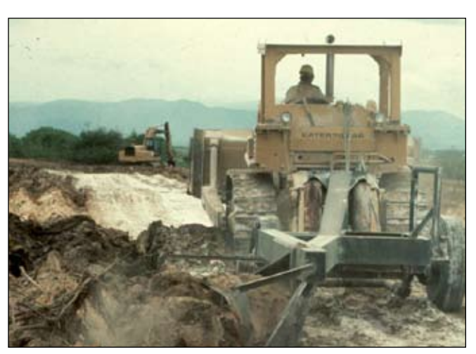
Deep plow tilling and incorporation of lime is an effective tailings remediation tool.

AR will pay an additional $3.35 million to DOI for NRD claims. DOI will provide approximately $700,000 of this to DEQ for implementation of the Federal Restoration Plan at the Grant-Kohrs Ranch. Up to $350,000 of the DOI NRD settlement will be used by BLM for restoration actions on BLM-managed parcels along the upper Clark Fork River. Because of the relative scale of the work and its geographic location, BLM will implement this work itself. The remainder of the settlement will reimburse DOI for assessments and ensure DOI oversight of future work.