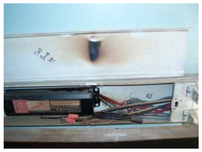
An old ballast that exploded unexpectedly.

Although a fluorescent lighting fixture retrofit might seem like a low educational priority in some schools when compared with other