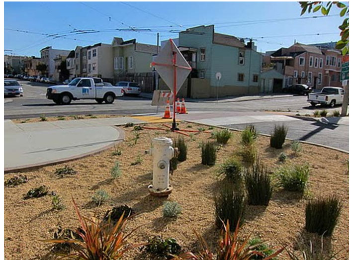
November 2011: Newcomb Avenue post construction.

EPA awarded $1.69 million for two projects to improve stormwater management. Newcomb Avenue, now recognized as the greenest street in San Francisco, was completed in December 2011. The project replaced a nearly 100% impervious streetscape with LID elements, such as permeable pavement, sidewalk landscaping, trees, and stormwater planters. San Francisco will also reduce storm water flows to the combined sewer system by 500,000 gallons per year using LID to retrofit a one-mile segment of Cesar Chavez Street. Construction is expected to begin in early 2013 and take approximately nine months to complete. Project results will inform future urban LID redevelopment and move San Francisco closer to its goal of reducing combined sewer overflows into the Bay.