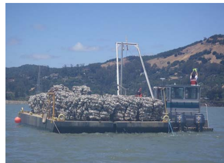
July 2012: Bagged oyster shells for submersion.