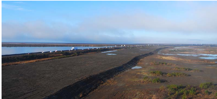
February 2012: Cullinan Ranch setback levee along Highway 37.

The SFBWQIF awarded the final $1.4 million needed (of $14.4 million) to Ducks Unlimited to allow this 1,549-acre restoration project. Ducks Unlimited started construction on the former ranch in 2011 and expects to breach the perimeter levee to restore hydrology in early 2014. Restoration will improve ecologic health, habitat connectivity and water quality in the lower Napa River and San Pablo Bay.