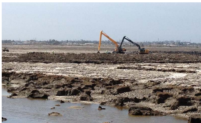
Spring 2012: Pond A17 site preparation.

The tidal wetlands habitat is being restored through levee lowering, levee breaching, and the construction of internal ditch blocks to redirect flows to remnant marsh channels. The project is on schedule for a levee breach in late 2012.