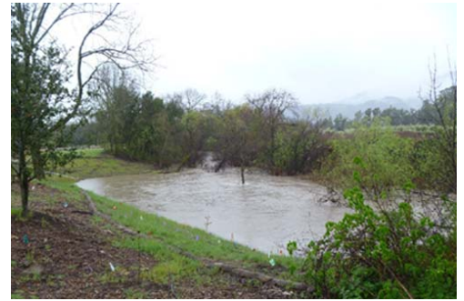
Top photo – January 2012: Napa River Rutherford Reach post construction; Bottom Photo – March 2012: Napa River Rutherford Reach.