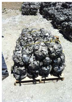
July 2012: Bagged oyster shells.