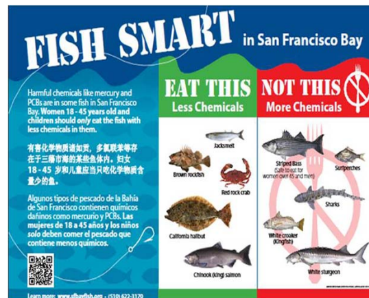
May 2012: Updated Fish Advisory.

EPA awarded a $5 million grant to work with Bay Area municipalities to identify, prioritize, and treat legacy sources of PCBs and mercury through localized site clean-ups and outreach to fishing communities. Fish and shellfish contaminated with PCBs and mercury pose health risks to humans and wildlife. Since these toxic pollutants are long-lived in the environment, it is important to reduce consumption of contaminated fish while continuing clean-up activities. Supported by a recently updated fish consumption advisory issued by the Office of Environmental Health Hazard Assessment, the California Department of Public Health, in partnership with community-based organizations, BASMAA, Bay Area county health officials, and the San Francisco Bay Regional Water Quality Control Board conducted risk reduction outreach to several Bay Area communities, developed a fish advisory PSA, and posted 75 fish advisory signs at fishing locations around the Bay.