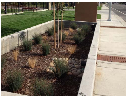
Top Photo – November 2011: During construction; Bottom Photo – January 2012: Tree well filter after installation.