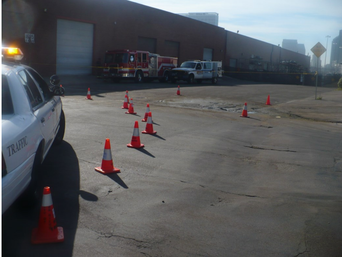
Stains on the ground caused by the acid spill

The case was investigated by the U.S. EPA Criminal Investigation Division, the FBI, and the San Diego Department of Environmental Health Service, Hazardous Materials Management Division. Back to Defendant Summary