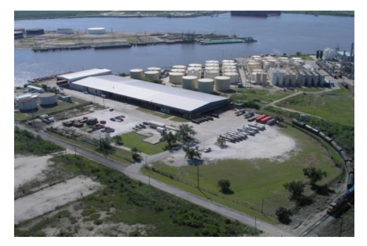
Port Arthur Chemical and Environmental Services

The case was investigated by EPA's Criminal Investigation Division and the U.S. Department of Transportation, the Texas Commission on Environmental Quality, the Houston Police Department, the U.S. Department of Labor and the U.S. Coast Guard. It was prosecuted by the Department of Transportation with assistance of Department of Justice's Environmental Crimes Section.