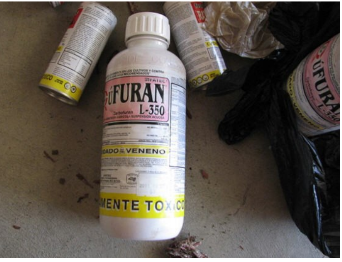
Smuggled Mexican pesticides involved in this investigation