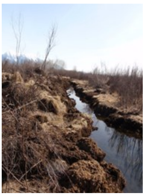
The affected wetlands border both Sabine Creek and Mission Creek, which flow into the Flathead River within the boundaries of the Confederated Salish Kootenai Tribal reservation.

Undeterred, in 2010, Powell again dredged several channels on his property in an effort to drain the wetlands and extend his agricultural land along the Sabine and Mission Creeks. The dredged material was cast off beside the channels and remained within the wetland area. As a result of the work, heavy sediment was observed in the manmade channels, and cloudy water was observed flowing into Sabine Creek from manmade channels.