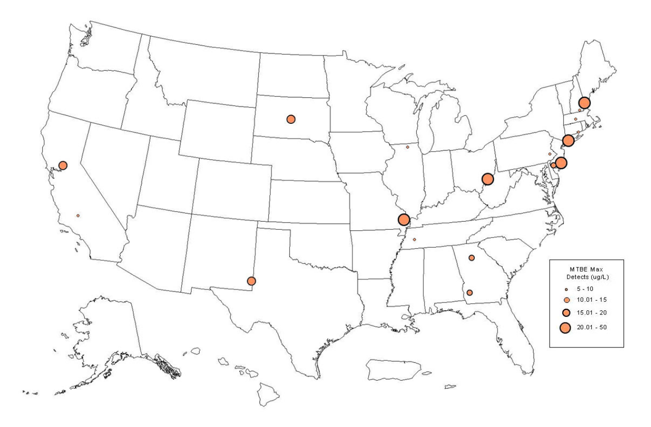
Exhibit 13-13: System-Level Geographic Distribution of MTBE in UCMR 1 Monitoring – Maximum Concentration at Each System with Detections

Compared with some national, regional, state, and local studies summarized in this report, the UCMR 1 occurrence data indicate low MTBE occurrence. When comparing UCMR 1 results to the results of other MTBE occurrence studies, several points should be considered. First, UCMR 1 is a survey of drinking water only. Many studies that report higher rates of MTBE occurrence (for example, USGS NAWQA studies and monitoring connected to UST investigations) are studies of ambient water.