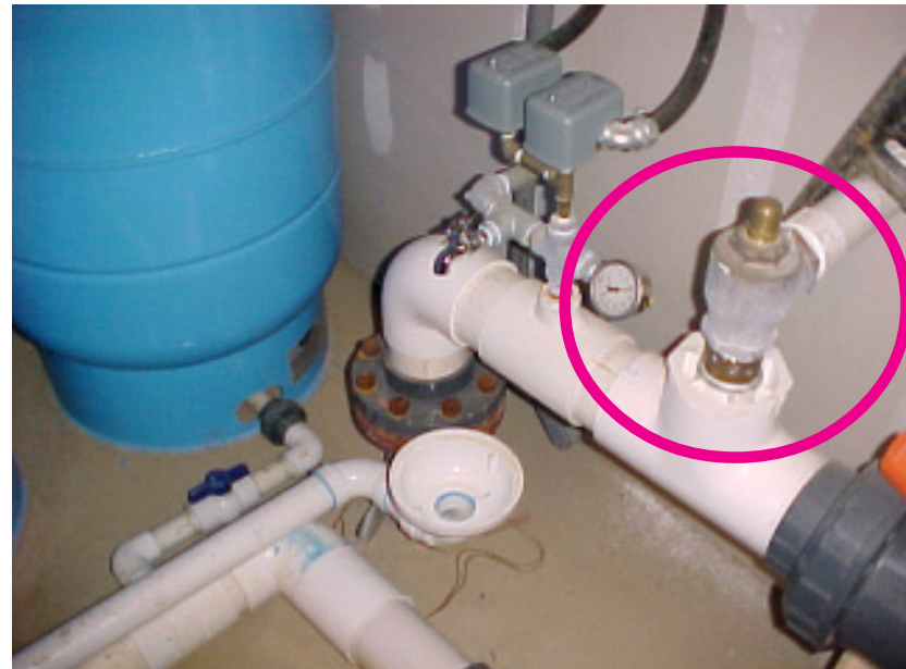
An Air-Pressure Relief Valve

Remember that the typical useful life of valves is 35 years.