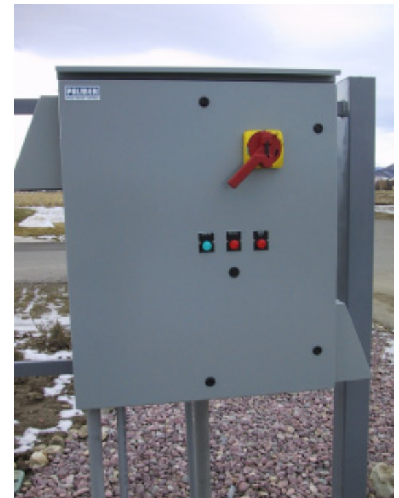
A Variable Frequency Drive

Remember that the typical useful life varies by type of electrical equipment. The typical useful life for computers is 5 years, sensors typically last 7 years, MCCs, and VFDs typically last 10 years, and transformers, switchgears, and wiring typically last 20 years. In this example, the adjusted useful life is the same as the typical useful life because the computer has been properly maintained.