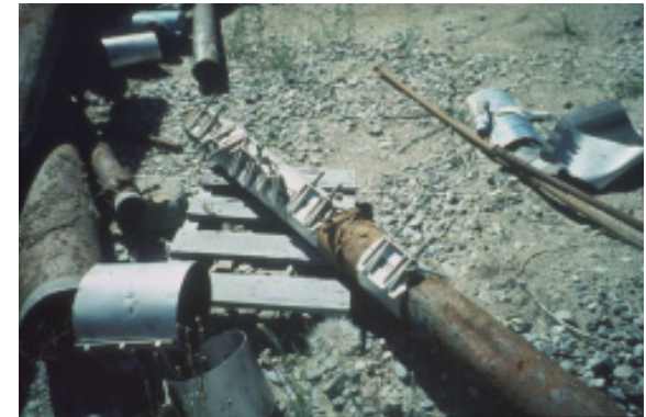
Service Lines Deliver Water to the Customer's Plumbing Connection

Remember that the typical useful life for service lines is 30 years.