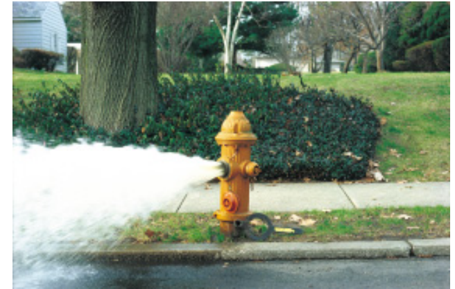
Hydrants Provide Water for Fire Suppression, Line Flushing, and Irrigation

Remember that the typical useful life for hydrants is 40 years. In this example, the adjusted useful life is the same as the typical useful life because both hydrants have been properly maintained.