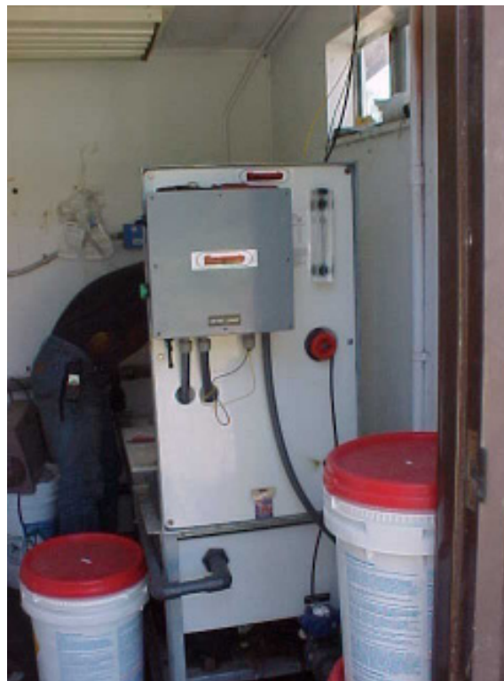
A Chlorination System

Remember that the typical useful life of disinfection systems is 10 years. In this example, adjusted useful life for the chlorinator is 5 years lower than the typical useful life because the system has not properly maintained it.