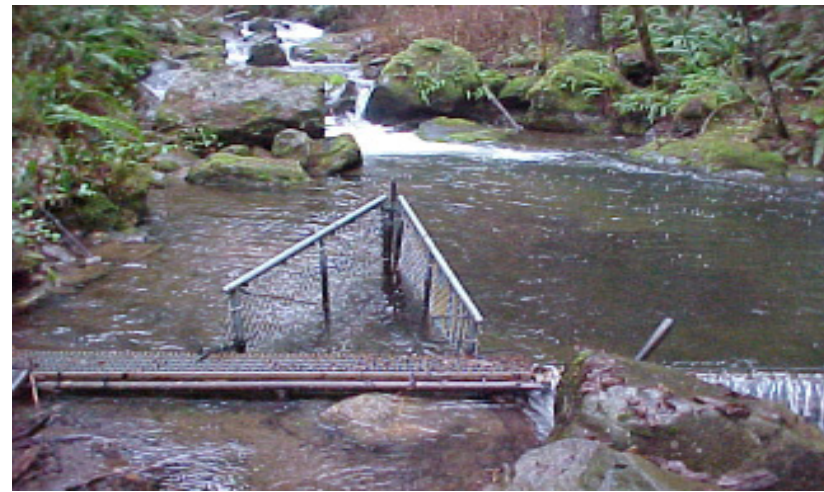
A Drinking Water Intake for a Surface Water System