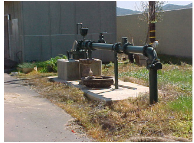
A Ground Water System Well