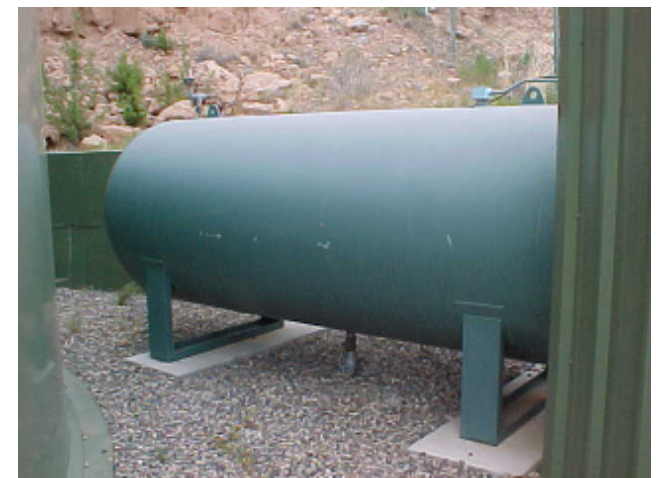
A Metal Storage Tank