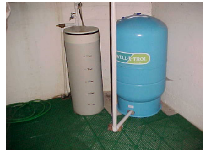
A Hydropneumatic Storage Tank