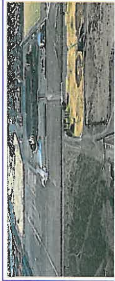
AMPAC currently operates an in-situ remediation system where perchlorate-contaminated

Wash. The discharge water from this remediation system has been consistently less than the Nevada Interim Action Level for perchlorate of 18 micrograms per liter or parts per billion (ppb).