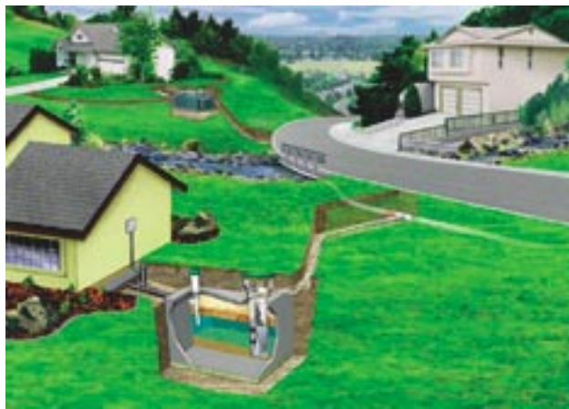
Cluster system diagram.

Picture for Illustration Purposes, courtesy of Orenco, INc.