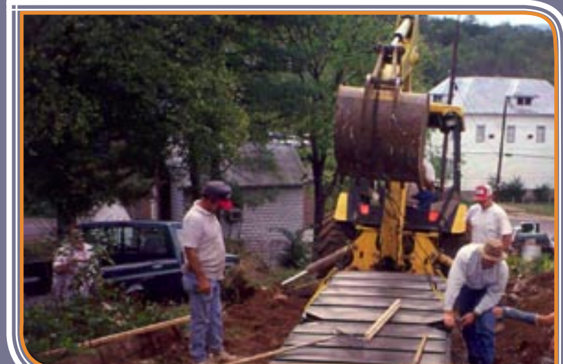
Installation of a peat sifter

Sponsored by the National Association of County Planners and the NACo Nonpoint Source Pollution Prevention Project