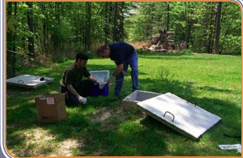
Inspections of a Septic tank.