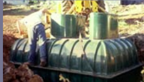
Installation of a septic tank.

National Association of City and County Health Officers http://www.naccho.org/project79.cfm