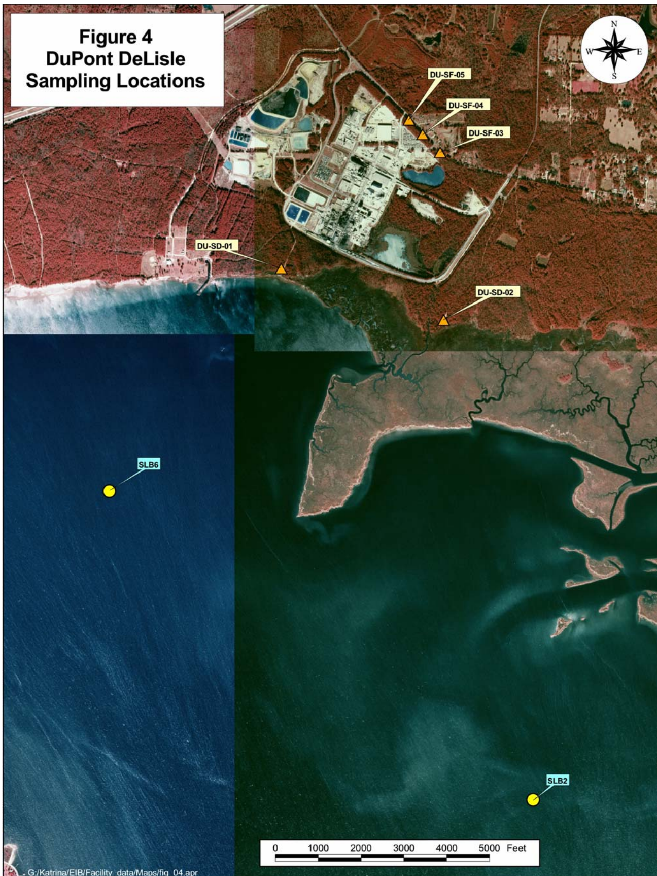
Figure 4 DuPont DeLisle Sampling Locations