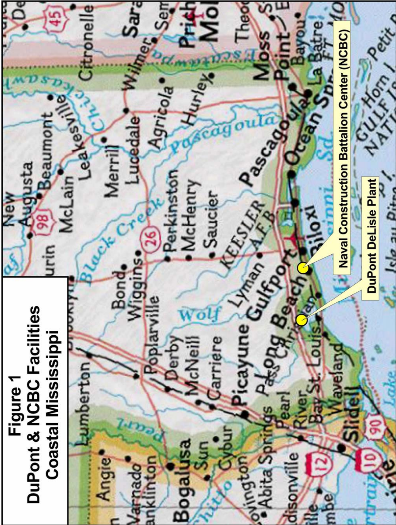
Figure 1 DuPont & NCBC Facilities Coastal Mississippi