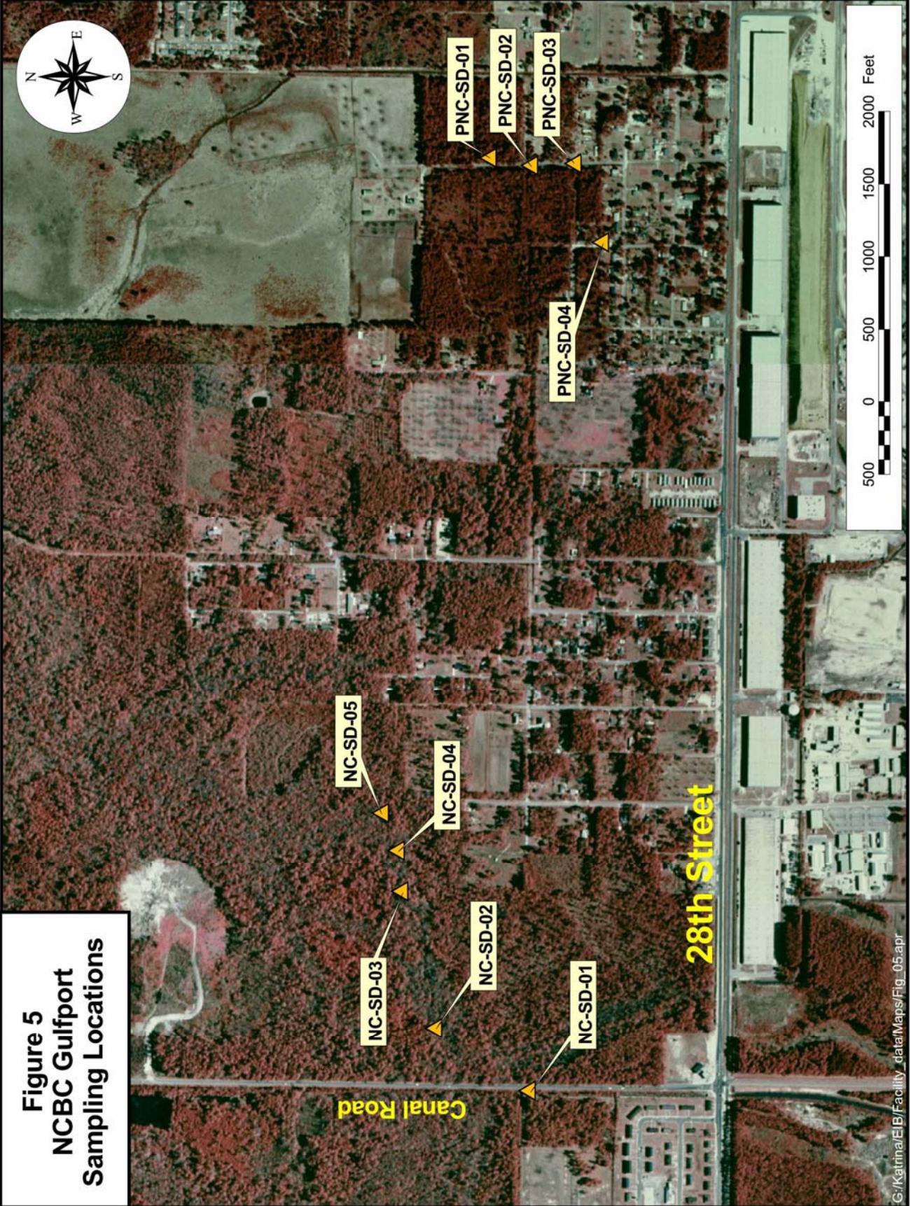
Figure 5 NCBC Gulfport Sampling Locations