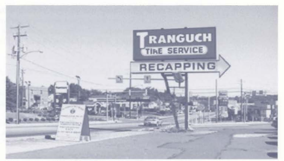
Tranguch Gasoline Site in Hazleton, Pennsylvania

However, we found that EPA should have communicated better with residents and the Pennsylvania Department of Health. EPA's poor communication resulted in many residents not trusting EPA, and EPA may have overcompensated by taking extra actions that may not have been needed. These actions may result in as much as $2.8 million in unnecessary costs.