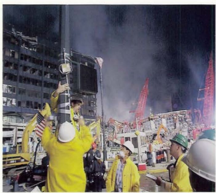
EPA personnel set up an air monitoring station near "ground zero" of the World Trade Center

April 1, 2001 through September 30, 2001