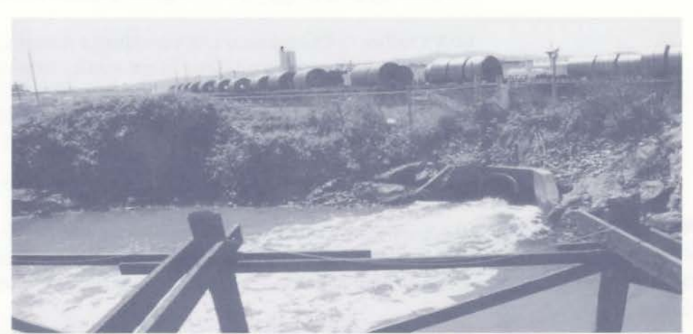
Wastewater discharge from a California facility into Suisun Bay

States evaluated did not have sufficient information on dischargers to effectively implement their enforcement programs. One reason was that EPA's Permit Compliance System was incomplete, inaccurate, and obsolete, since the growth, variety, and complexity of the regulated community had greatly outstripped the system capabilities. States had other weaknesses in their compliance monitoring and enforcement systems, including not reporting serious, significant violations.