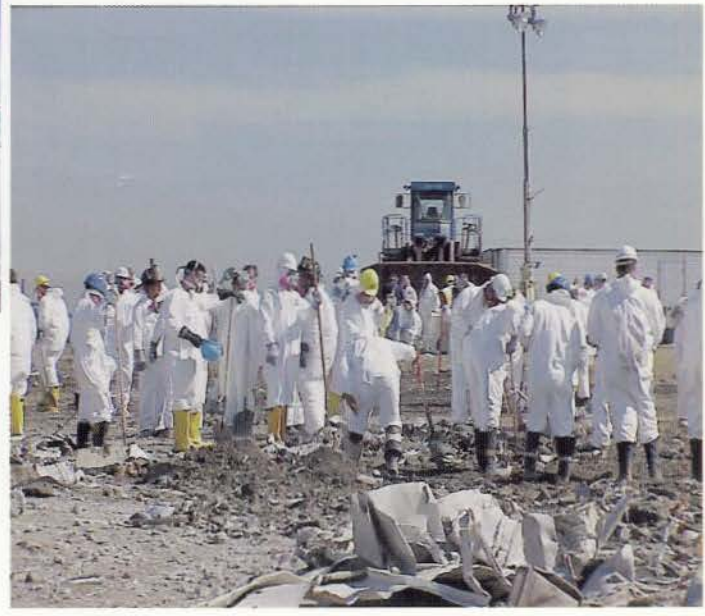
EPA investigators and other law enforcement officials search through World Trade Center debris taken to a Staten Island landfill