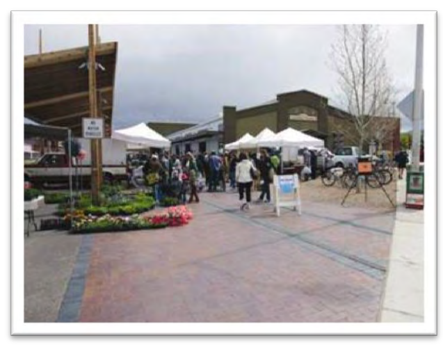
Santa Fe Farmer's Market, Santa Fe, New Mexico