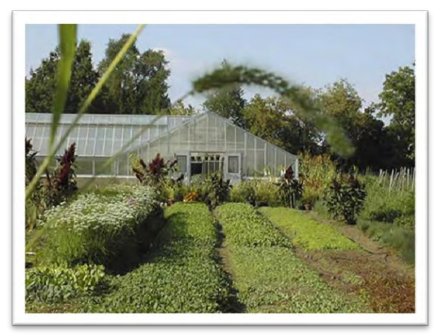
Urban Oaks Farm, New Britain, Connecticut