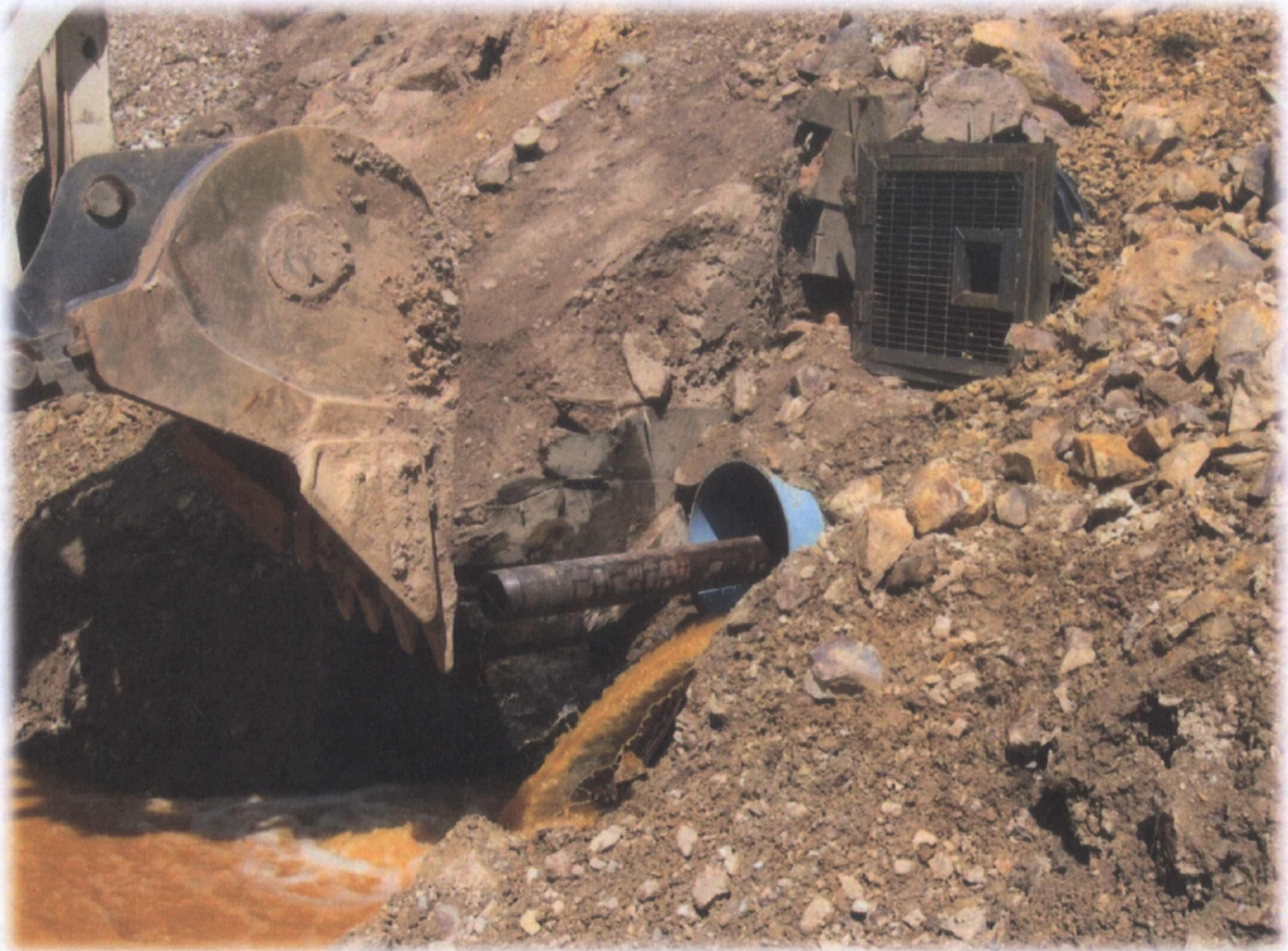
Gold King Level 7 Old Portal with well-point installed through the drain pipe. This portal may be re-opened in a future project to help stabilize the mine drainage and prevent future increases in mine pool head .

The mine drainage at the Gold King Level 7 Mine contains extremely high levels of metals and continues to flow between 150 and 300 gallons per minute. The mine drainage began after bulkheads were installed in the American Tunnel in 1995, which previously deep-drained the mining district. The mine drainage and the collapse at the Level 7 Old Portal continues to be of concern to the landowner, DRMS, and ARSG. A future project at the site may attempt to cooperatively open the Level 7 Old Portal in an effort to alleviate the potential for an unstable increase in mine pool head within the Gold King workings.