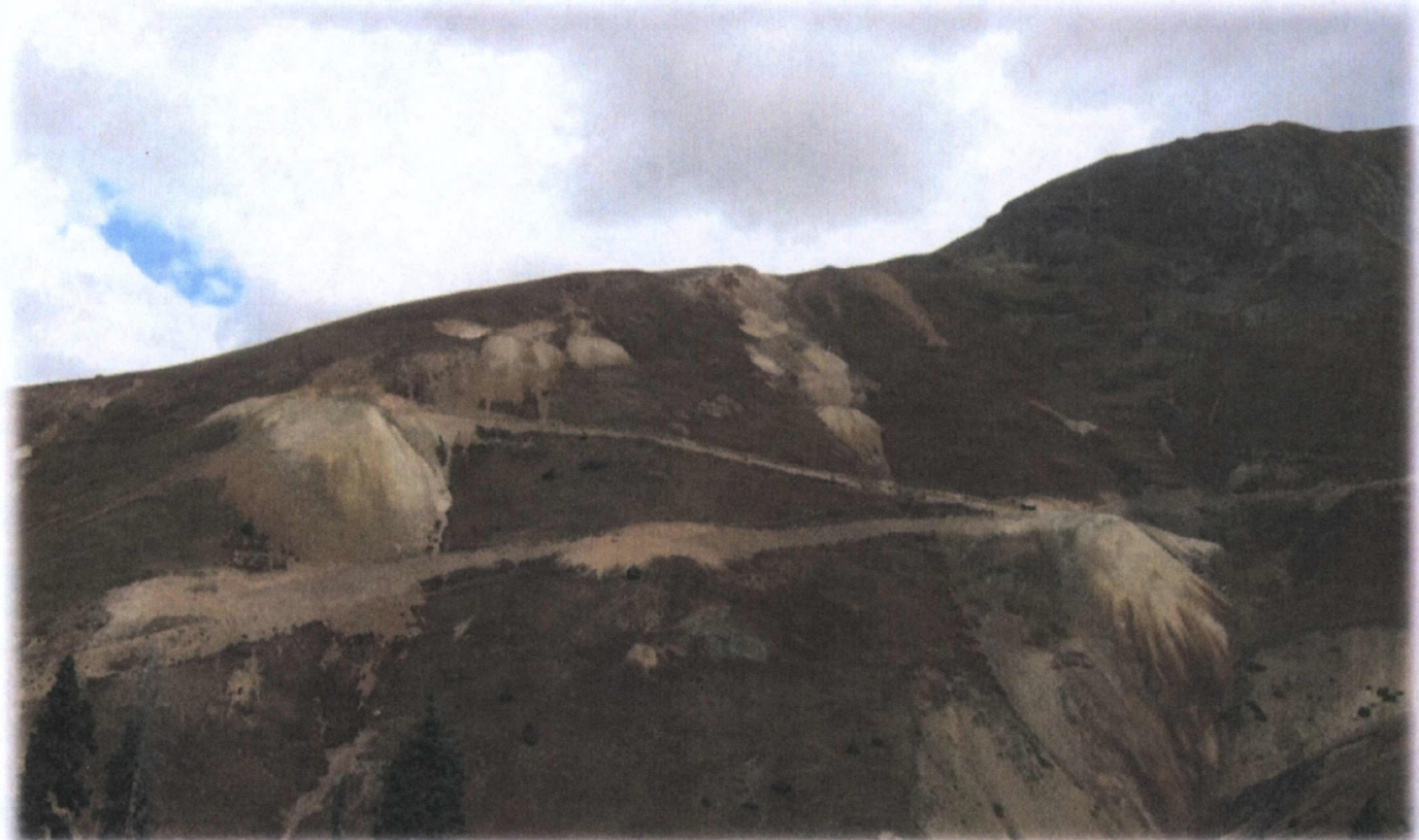
Sampson Portal, Drill Road, and Number 1 Portal as viewed from access road after reclamation. Drill Road has been re-contoured and revegetated in this photo.