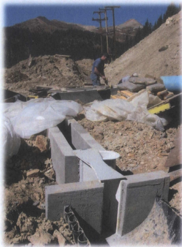
Gold King Level 7 Old Portal with 2" Parshall Flume Installed in Concrete Lined Ditch