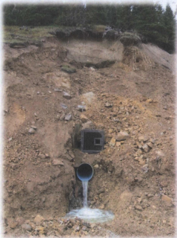
Gold King Level 7 Old Portal Closure