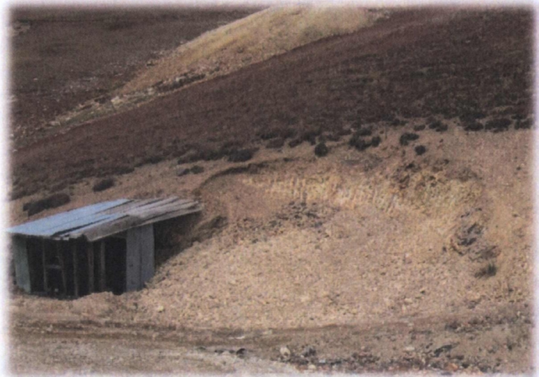
Number 1 Portal backfilled

One change order was issued on 9/17/2009 to increase the project cost by $14,980.00. There were two increases in cost to the project budget. The concrete lined ditch needed additional concrete work to make the ditch larger in order to carry the larger than estimated quantity of mine drainage for an increased cost of $12,480.00. The well point installed in the Level Seven Old Portal was also an additional cost of $2,500.00. The entire bond amount was expended on this project and the additional funding ($2,082.74) came from the State Appropriated Bond Forfeiture Severance Tax.