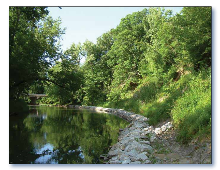
Figure 2. A CWA section 319-funded streambank stabilization project on the North Fork Vermilion River.

Nonpoint source pollution control efforts involving BMP implementation are helping to restore Lake