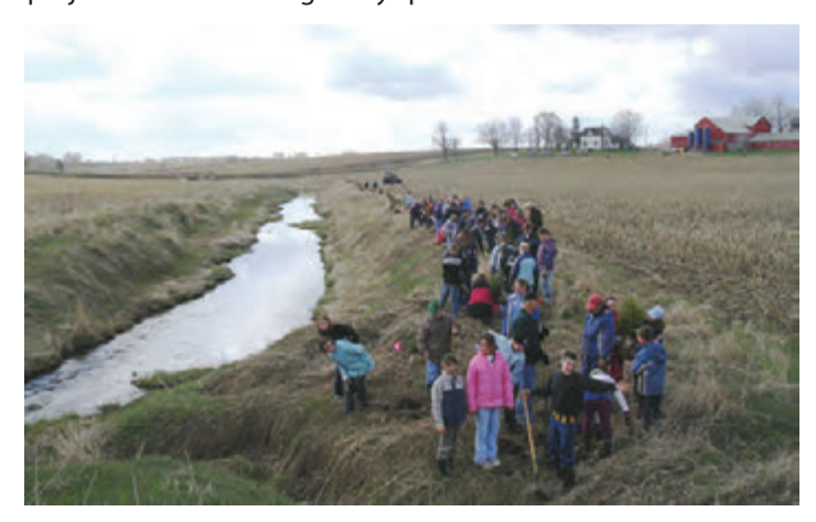
Students participate in a shoreline re-vegetation project that will help to reduce nutrients and improve water quality in the nearby stream and ultimately Lake Erie.

At the same time, habitat protection and restoration projects are also underway in the Maumee River watershed. GLRI projects totaling more than US$6 million are effectively restoring wetland, coastal, and riparian habitats resulting in improved water quality, healthier fish and wildlife populations, and increased property values near restored areas. These projects are benefitting many species of concern.