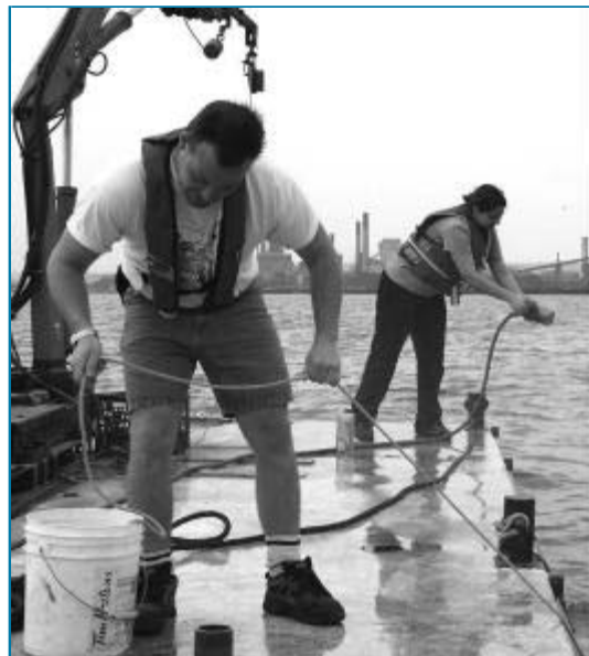
Researchers collect phytoplankton, zooplankton and water samples from Lake Ontario.

or tracking emerging issues, we're always working together with our partners to improve our Great Lake.