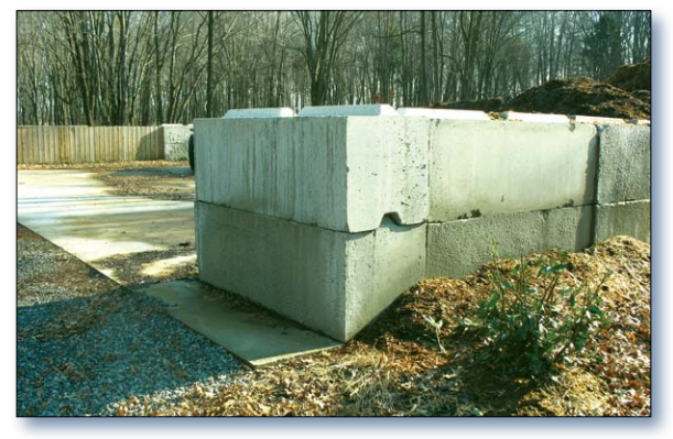
Figure 2. Some farmers in the watershed installed manure storage facilities like this one.

and Papakating rivers. The initial assessments indicated that runoff from agricultural areas was likely negatively affecting water quality in the Wallkill River watershed. Shortly thereafter, the WRWMG coordinated with North Jersey Resource Conservation & Development Council (NJRC&D) and the U.S. Department of Agriculture's (USDA) Natural Resources Conservation Service (NRCS) to begin restoring the Wallkill River watershed. In 2002, the NJRC&D received a CWA section 319(h) grant in partnership with the NRCS to implement agricultural BMPs throughout the Wallkill watershed. From 2003 through 2006, the partners used the grant funds to establish a project steering committee; implement agriculture BMPs such as integrated crop, nutrient and pasture management (Figures 2 and 3); help agricultural landowners transition to organic farming practices; and provide targeted technical training programs about agricultural BMPs for farmers.