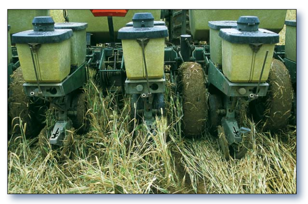
Figure 3. Many farmers adopted no-till farming, which requires specialized equipment.

Implementing agricultural BMPs and improving farming practices reduced nutrients in stormwater runoff, allowing water quality to improve in the Wallkill River's "Martin's Road to Hamburg" and "Hamburg to Ogdensburg" assessment units. NJDEP collected 25 samples annually between 2005 and 2008 in the "Martin's Road to Hamburg" segment and determined that the segment met the phosphorus water quality standard of 0.1 mg/L.