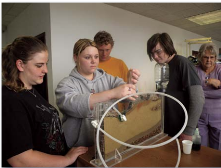
Figure 2. Gage High School students demonstrate a groundwater model during an education event.

Enviroscape watershed model and a ground-water model at least annually (Figure 2). Annual mini-academy training is offered for students and teachers at Gage High School to educate the watershed residents about how nonpoint source pollution can affect water quality. Active volunteer monitoring and education is continuing in the watershed.