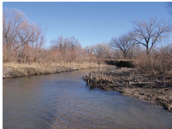
Figure 1. Wolf Creek flows through portions of Oklahoma and Texas.

Landowners implemented numerous BMPs with support from Oklahoma's locally led cost-share program and Natural Resources Conservation Service (NRCS) programs such as the Environmental Quality Incentives Program (EQIP), Conservation Reserve Program (CRP), Grassland Reserve Program (GRP) and Wildlife Habitat Incentives Program (WHIP). In addition, NRCS initiated an EQIP Local Emphasis Area project in the Wolf Creek watershed focused on grazing land. From 2002 to 2006, landowners improved more than 9,900 acres of pasture and hay land and 87,467 acres of rangeland through supplemental planting efforts. They implemented