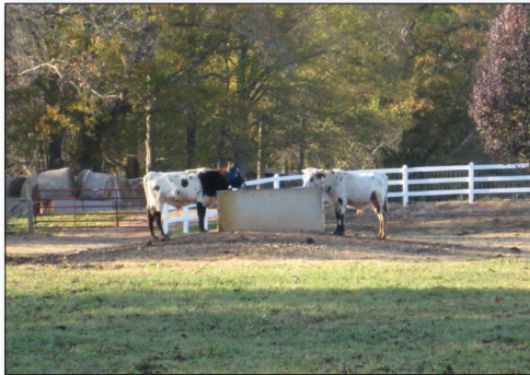
Figure 2. Agricultural BMPs such as reinforced creek crossings and alternative water sources (wells and troughs) limit livestock access to streams and provide clean drinking water.

As part of this project, landowners implemented several BMPs, including 182 acres of vegetative riparian buffers, more than 17,000 square feet of heavy-use area protection, 10 onsite wastewater treatment systems, 12 alternative water source units (Figure 2), five structures for water control, and 104,000 feet of fencing that excluded 675 cattle and 42 horses from streams in the watershed. In addition, one constructed wetland was built to alleviate issues associated with a failing septic system. To encourage additional members of the community to install and use BMPs, project partners hosted field days and farm tours on properties where BMPs