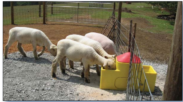
Figure 2. A farmer installed this livestock watering facility using cost-share money from the state's Agricultural Resource Conservation Fund.

Biological reconnaissance (biorecon) is one tool used to recognize stream impairment as judged by species richness measures. The biorecon index is scored on a scale from 1 to 15, where a score of less than 5 is considered very poor , and a score of more than 10 is considered good . The biorecon score during TVA's 2007 sampling was 13, which is considered good for this area. Later in 2007, TDEC and TVA performed additional biological monitoring on Gallagher Creek and found it to have good