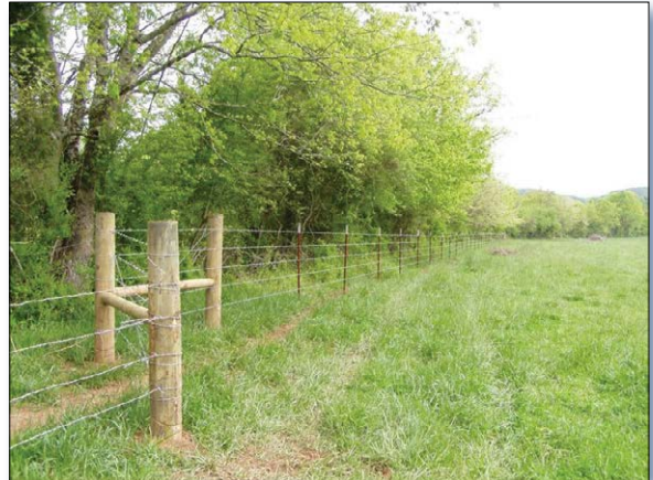
Figure 3. A farmer installed this fence to prevent livestock from accessing and eroding streambanks.

habitat scores. On the basis of these data, TDEC removed all 13.2 miles of Gallagher Creek from the state's CWA section 303(d) list in 2010.