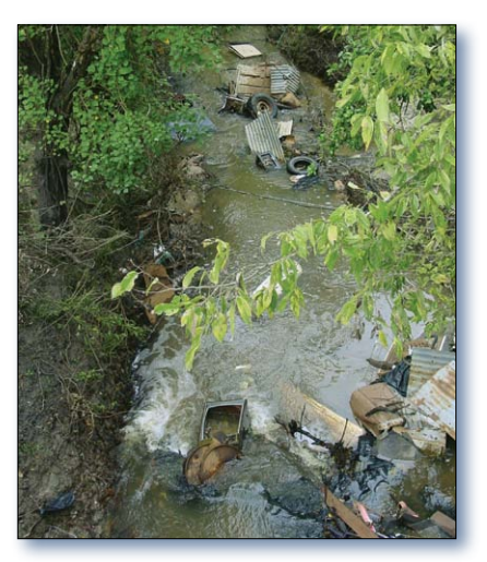
Figure 2. An illegal dumpsite in Tres Palacios Creek.

anti-dumping slogans in 24 locations, and aired a 30-second radio spot on 12 radio stations.