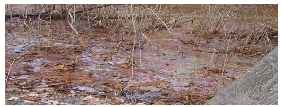
Iridescent sheen at Wildcat Landfill, April 2008.

During our physical inspection of the site we observed a sheen on the surface waters throughout the site. The sheen was iridescent and oily in appearance (see photo below). While this sheen could be harmless, it could also indicate the presence of a petroleum product. Region 3 personnel said they were aware of the sheen at the Site but had concluded that it was naturally occurring.