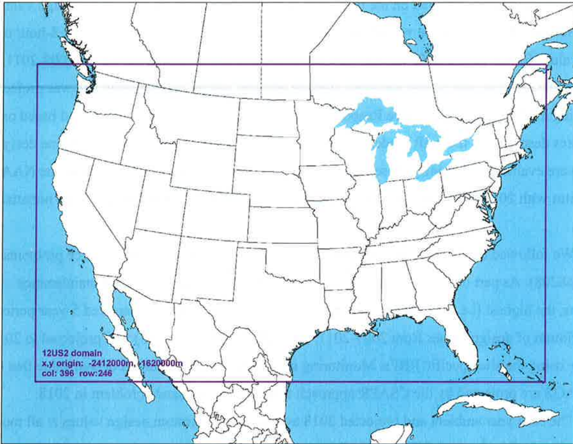
Figure 1. Air quality modeling domain (area within the purple lines).