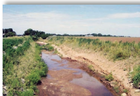
Potential sources of sediment and nutrients in the Salt Fork watershed before implementing the BMPs: fields were often cultivated or grazed to the edge of the stream; riparian buffers were nonexistent or rare.

Educating agricultural producers was a top priority for the Salt Fork watershed program. Better management techniques for sediment, nutrient, and pest control, such as no-till and reduced-till planting; proper fertilizer and chemical (pesticide, herbicide, fungicide) application; the use of crop varieties that require fewer chemicals; and riparian buffer zone establishment were taught through multiple channels. Ten BMP demonstration projects showed producers that BMP implementation need not affect their bottom line or production volumes. Numerous educational meetings, tours, and field days, in combination with a