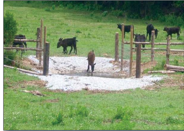
Figure 2. This stream crossing protects the stream bed while offering cattle access for drinking.

Through local community organizations (non-profit organizations, churches, etc.), the Clemson University Cooperative Extension shared information with homeowners about septic system maintenance needs and cost-share opportunities for septic system repairs. In addition, Extension reviewed existing aerial photographs and maps of septic system pump-out occurrences, and worked with septic pumping contractors to identify potential failing septic systems and high-risk communities. Extension agents worked with the Enoree River Educational Board to implement education and outreach programs, including the 4-H2O Pontoon Classroom/River Adventure, storm drain stenciling and Adopt-A-River.