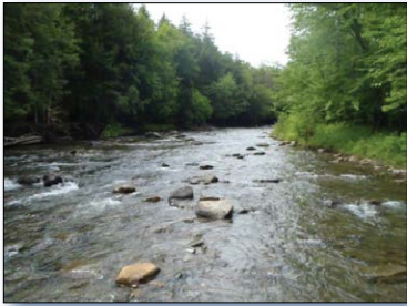
Figure 2. The WBOR before (top: pre-2009) and after (bottom: post-2012) implementation of restoration efforts.