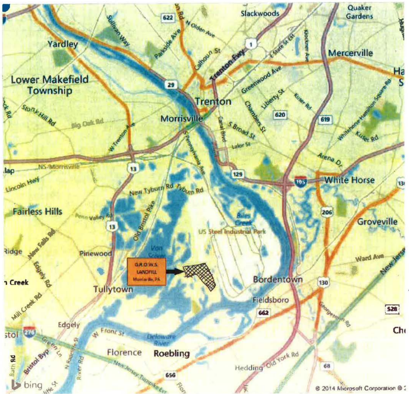
G.R.O.W.S. Landfill FIGURE 1