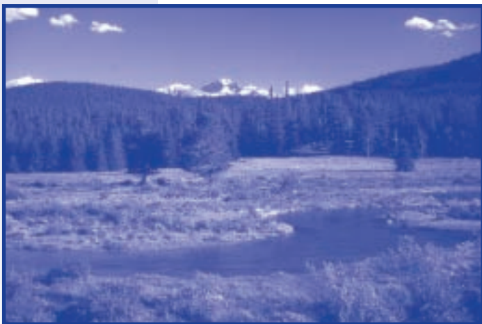
In 1982 these meadows and wetlands at Horseshoe Park in Colorado were hit by a 25 to 30 foot wall of water. The height and speed of the flood waters were reduced by the wetland vegetation, and the damaging flood peak was greatly reduced.

The Middle Fork of the North Branch of the Chicago River flows through an abandoned farm field in the suburbs. The area was identified as the future location for a trail, part of the North