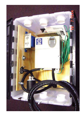
VFD mounted in box

with a VFD are readily available from the nearest hardware supplier. Consult your licensed electrician to see if a VFD is right for your utility.