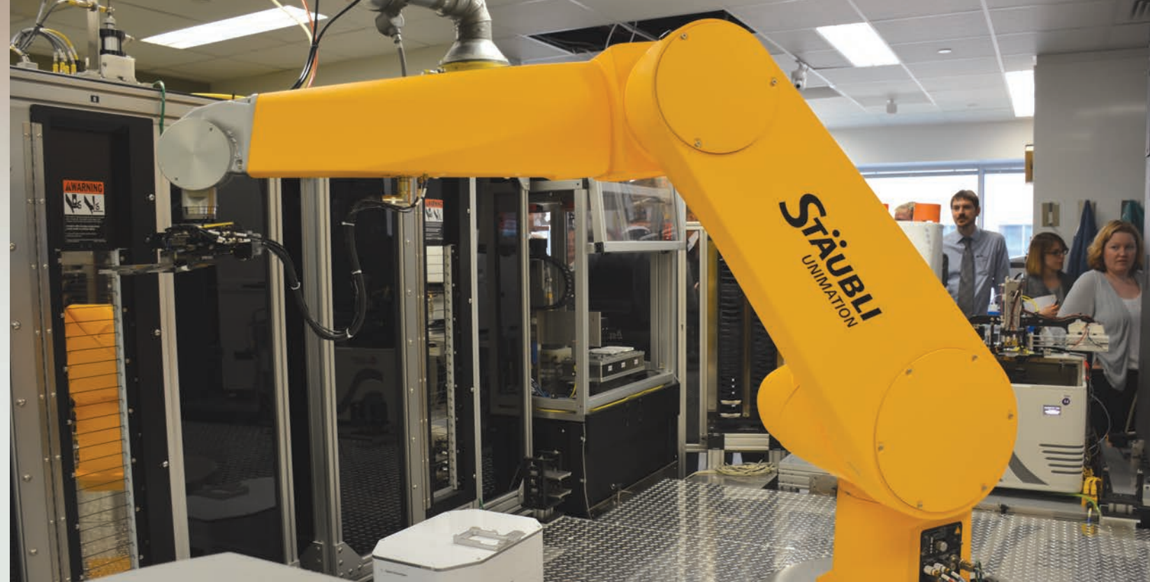
The Tox21 robot, developed in a collaboration between EPA, NIH, and FDA, helps conduct high-throughput screenings.