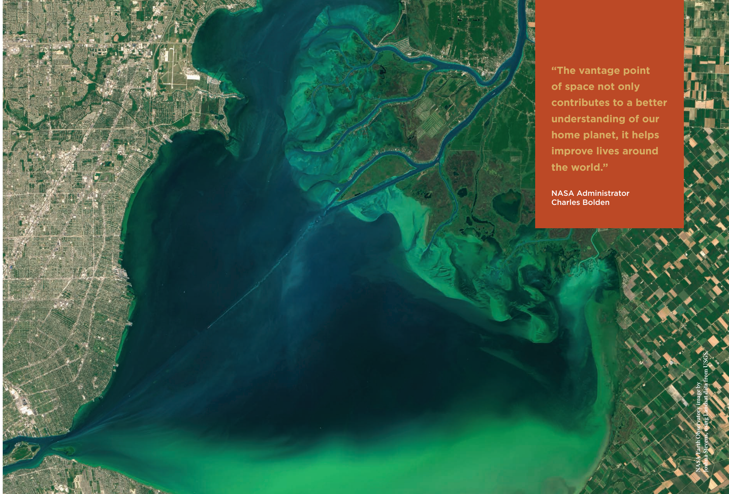
Algal bloom in Lake St. Clair.

“The vantage point of space not only contributes to a better understanding of our home planet, it helps improve lives around the world.”