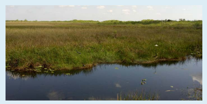
Sea level rise poses a particular risk for the Everglades—a vast, ecologically rich area, much of which is within a few feet of sea level.

The Everglades are vulnerable to both changing climate and rising sea level. Human activities have impaired this ecosystem by diverting the natural flow of water away from the Everglades to prevent flooding or to supply farmers and municipalities with