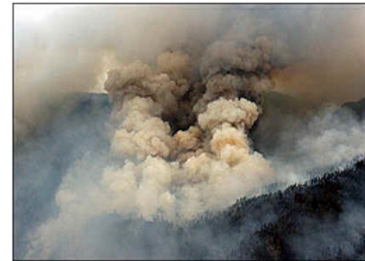
Smoke plume from the Hayman fire.

Since the fire, precipitation events have resulted in massive soil erosion and dumped enormous quantities of sediment into Denver Water’s reservoirs and intake systems. The domestic water supplier to the City of Denver has expended tens of millions of dollars in water quality treatment, sediment and debris removal, slope reseeding, and infrastructure projects as a result of the fire.