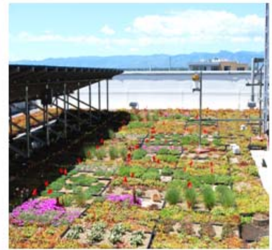
The EPA Region 8 Headquarters' green roof with study plots and instrumentation. The solar panels provide beneficial shade during hot weather.

Slabe, T. and O'Connor, T. 2011. DRAFT - Thermal Characteristics of an extensive green roof and a gravel ballasted roof in high elevation, semi-arid, temperate Denver, Colorado, U.S.A. EPA/R-600/XXX-08. December, 2011.