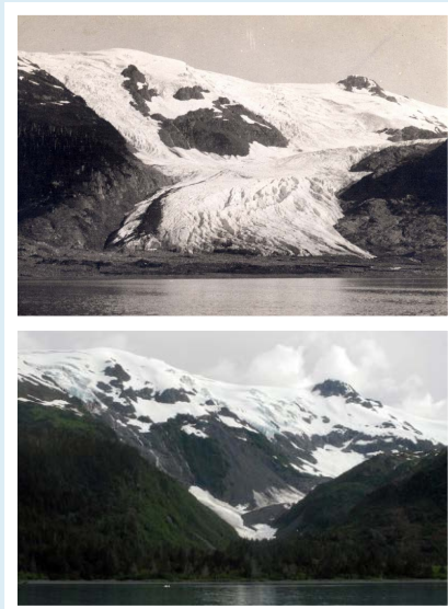
Toboggan Glacier near Prince William Sound in August 1905 (top) and August 2008 (bottom). The glacier has thinned by nearly 500 feet and retreated by about 0.3 miles.

Rising temperatures have reduced the area of land covered by glaciers and water covered by sea ice, and will continue to do so. Glaciers have retreated dramatically during the last century in southeast Alaska, in the Alaska Range, and along the south central coast. In Glacier Bay National Park, for example, Muir Glacier has retreated more than 31 miles since it was first observed in the late 19 th century.