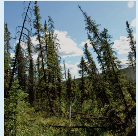
"Drunken forests" occur when the permafrost under trees thaws, causing them to lean.

In south-central Alaska, during the 1990s, milder winters and warmer temperatures increased the winter survival of the spruce bark beetle and allowed it to complete its life cycle in one year instead of the normal two years. Nine years of drought stress weakened spruce trees' normal defense mechanisms against the beetles. This