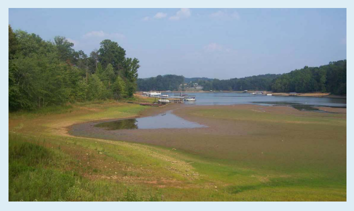
A drought in 2007 lowered water levels in Lake Lanier, which threatened metropolitan Atlanta's water supply and interfered with recreational activities. Droughts could become more severe as the climate warms.

next half century. But the amount of available water is likely to decrease, and soils are likely to become drier in most of the state, except along the coast.