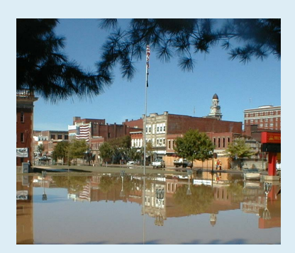
Five inches of rain over 48 hours flooded Marietta in September 2004.

Flooding occasionally threatens both navigation and riverfront communities, and greater river flows could make flooding worse. In 2011, a combination of heavy rainfall and melting snow caused a flood that closed the lower Ohio River to navigation. Heavy rains and melting snow in March 2015 caused the Ohio