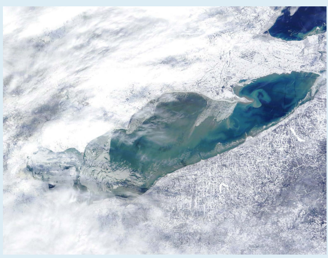
A satellite view shows ice forming on Lake Erie, particularly at the western end. In a typical year, nearly the entire surface of the lake freezes.

In Lake Erie, the changing climate is likely to harm water quality. Warmer water tends to cause more algal blooms, which can be unsightly, harm fish, and degrade water quality. During August 2014, an algal bloom in Lake Erie prompted the City of Toledo to ban drinking and cooking with tap water. Severe storms also increase the amount of pollutants that run off from land to water, so the risk of algal blooms will be greater if storms become more severe. Increasingly severe rainstorms could also cause sewers to overflow into the Great Lakes more often, threatening beach safety and drinking water supplies.