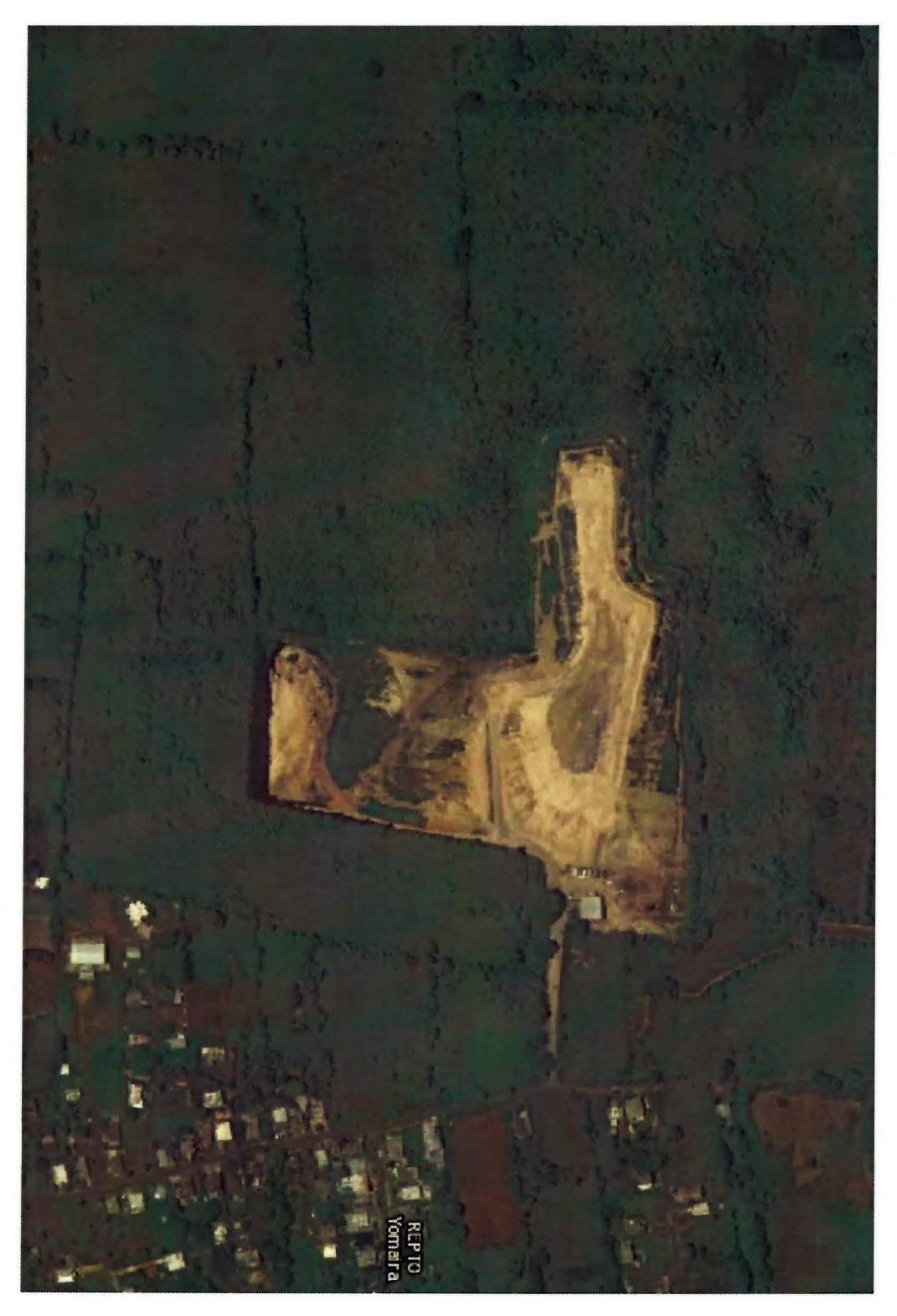
Figure 2: Isabela Landfill