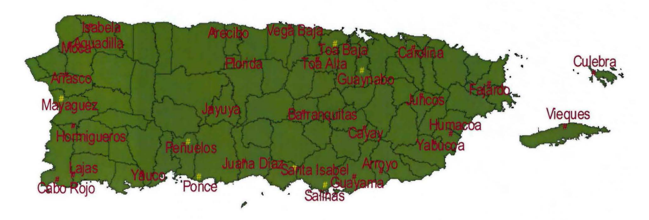
Figure 1: Isabela