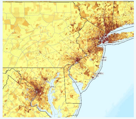
Pictured: Percent of workers who commute to work by public transportation

Accessibility - e.g., transit service, street intersection density, commute modes/commute times