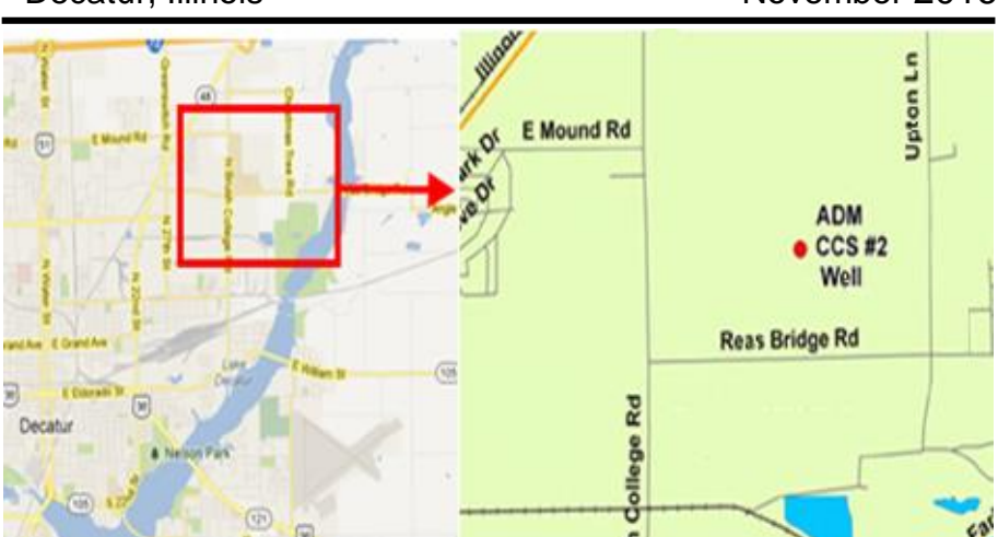
This map shows where the injection well is located.

You may call EPA toll-free at 800-621-8437, 8:30 a.m. – 4:30 p.m., weekdays.