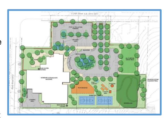
Site design for Salvation Army Harrisburg project.

And the Salvation Army complex will give a boost to the neighborhood. The organization said the site is ideally situated near those most in need of its services, is accessible via a central bus route, and is in close proximity to several local schools.