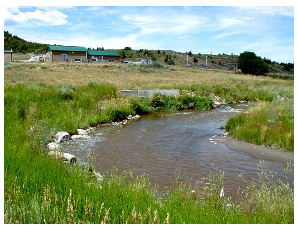
Figure 3 - Discharge Point 002A into Rock Creek

Description of 002 A: Wastewater discharged from the final UV disinfection system through the v-notch weir and into the effluent outfall pipe. The effluent outfall pipe terminates 5 feet from Rock Creek and spills onto rockworks leading to Rock Creek (Figure 3).