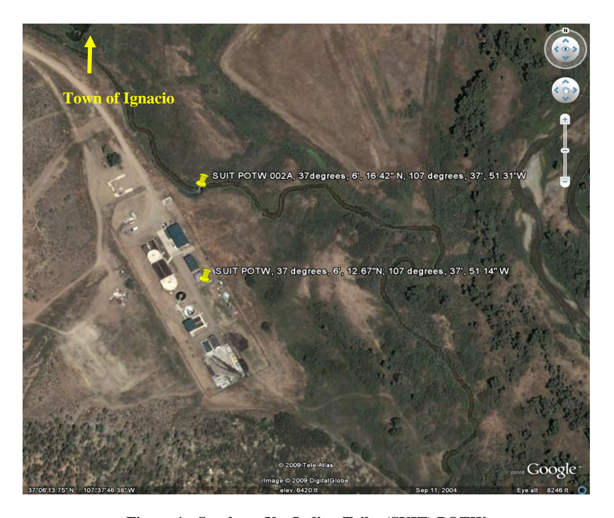
Figure 1 - Southern Ute Indian Tribe (SUIT) POTW

A process flow schematic diagram of the SUIT POTW is shown in Figure 2.