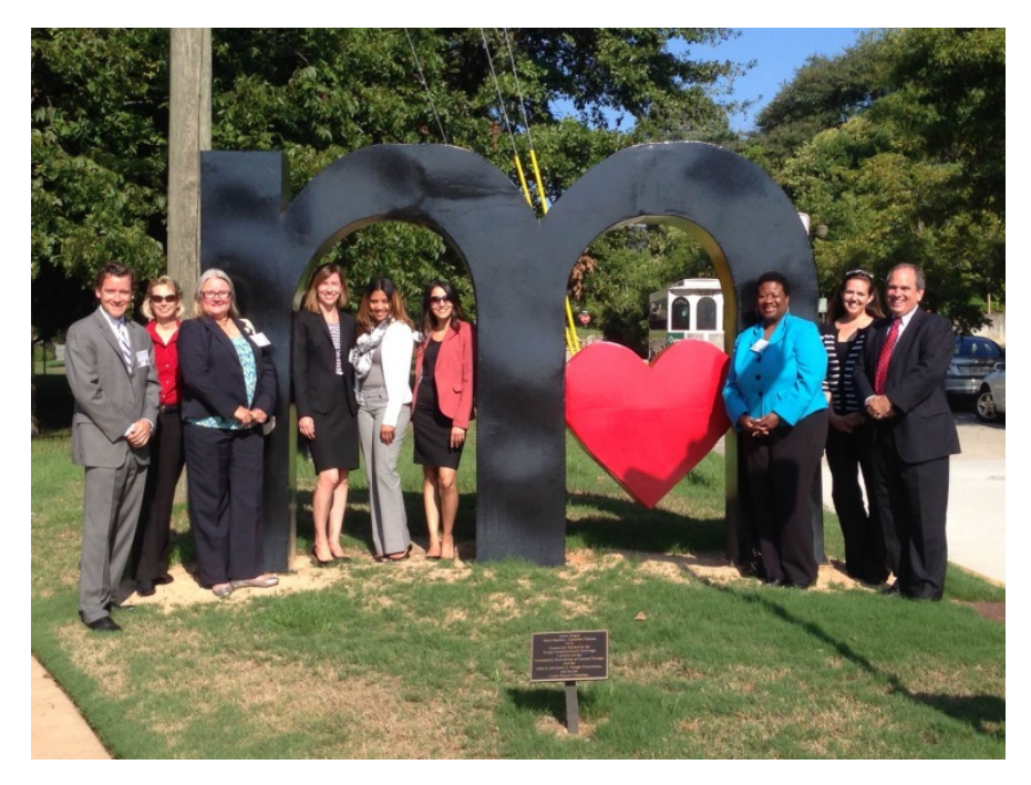
Members of the SC2 team in Macon, Georgia.