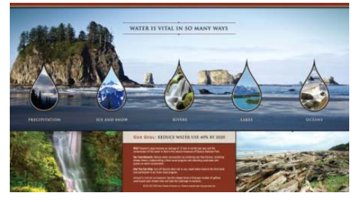
This brochure informed guests of Kalaloch Lodge's water use reduction goals.