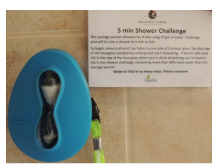
Guests and employees save water through the five-minute shower challenge.