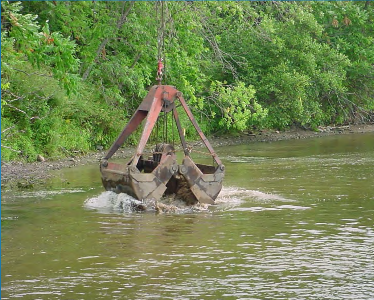
2001 Capping Pilot Study – cap material placement