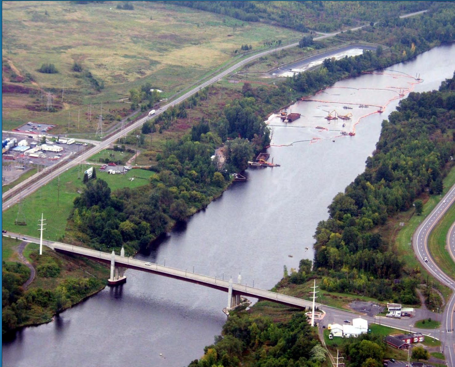
Aerial view of 2005 Remedial Options Pilot Study