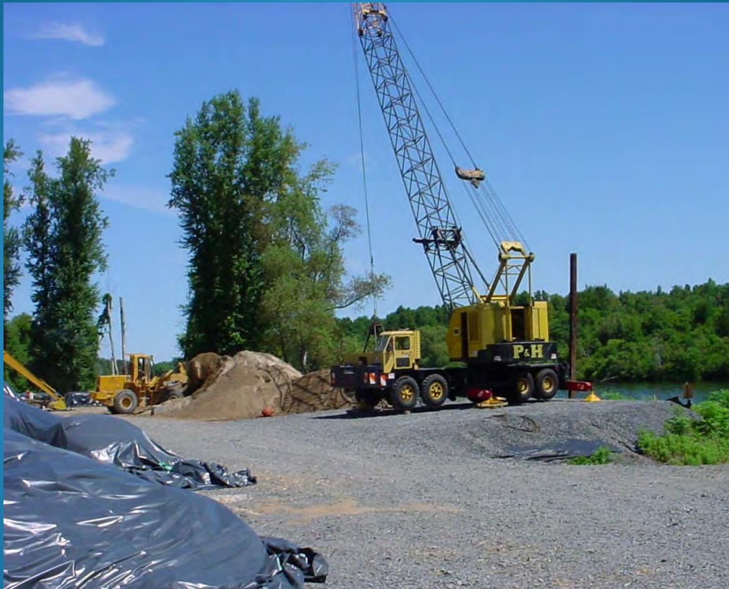
2001 Capping Pilot Study – material staging area