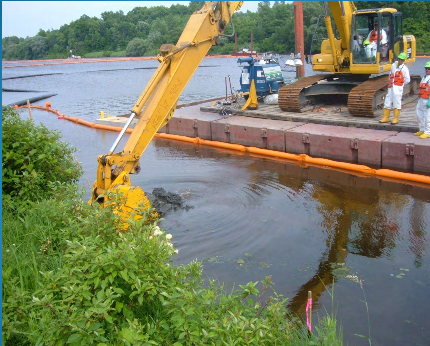
2005 Remedial Options Pilot Study – near shore excavation