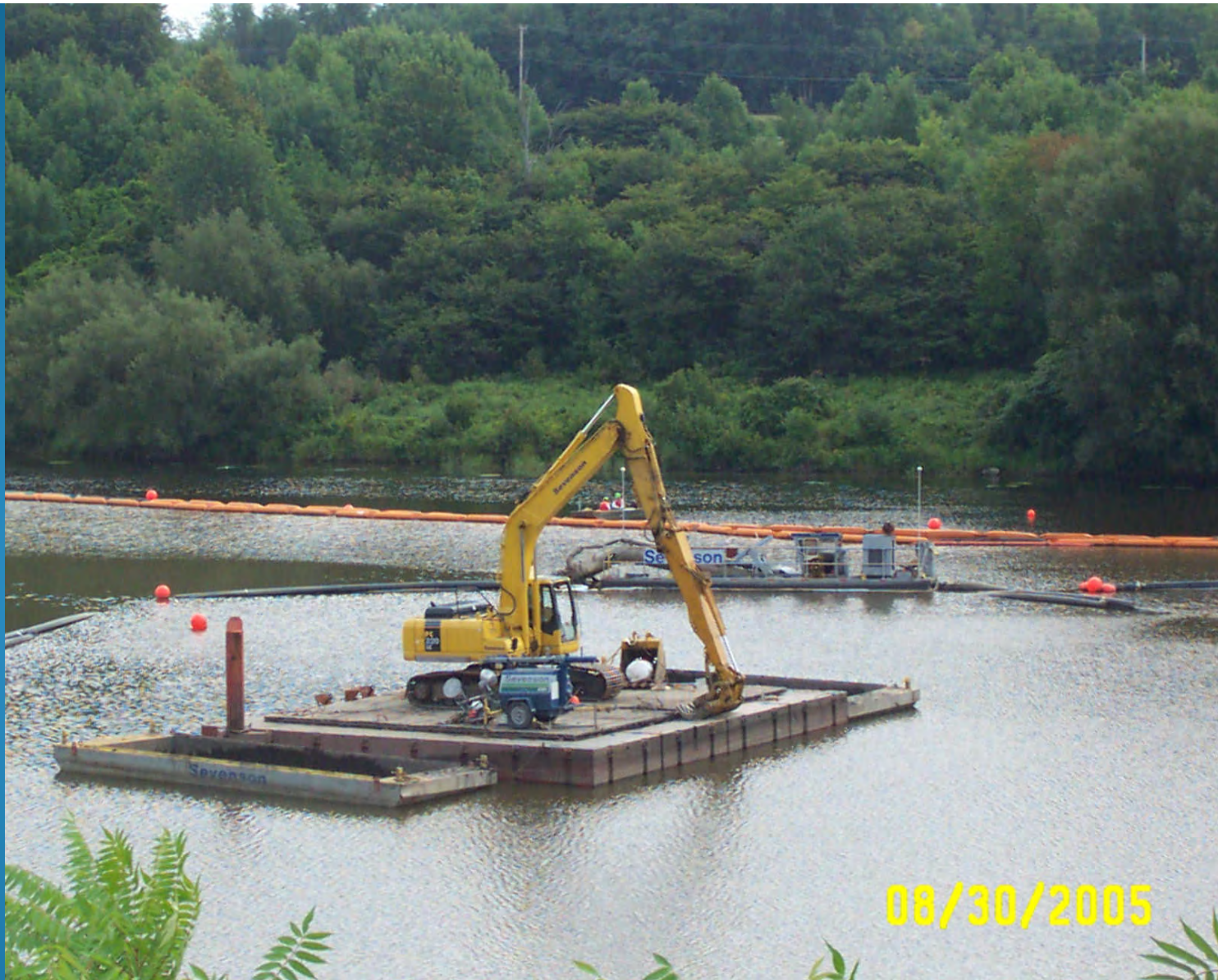
2005 Remedial Options Pilot Study – main channel dredging, debris removal, and water column monitoring