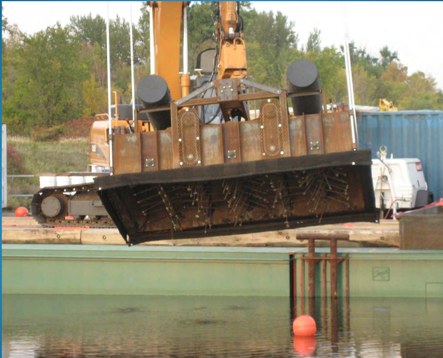
2006 Activated Carbon Pilot Study – carbon tiller/mixer