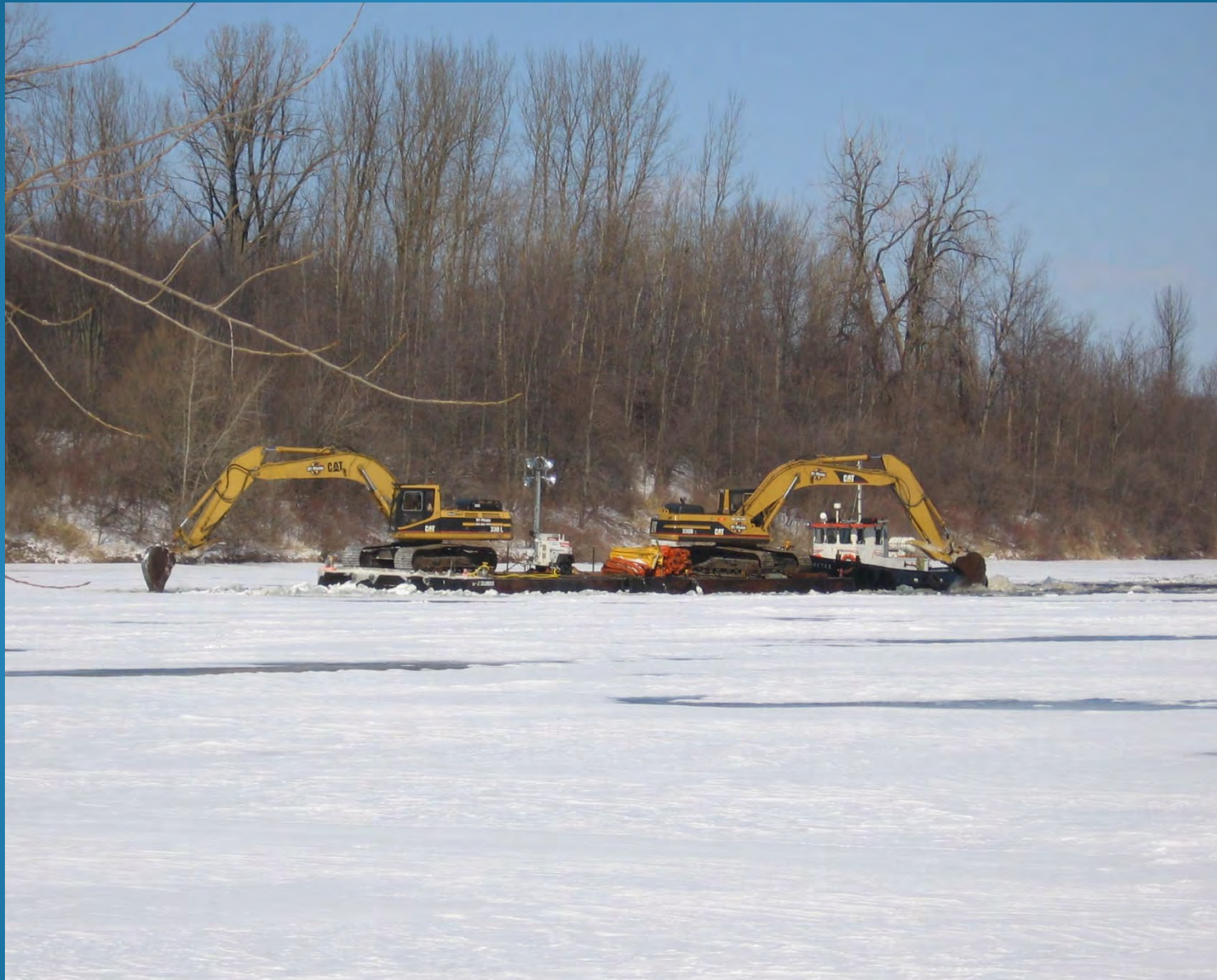
2007 Ice Breaking Demonstration Project – ice breaking efforts