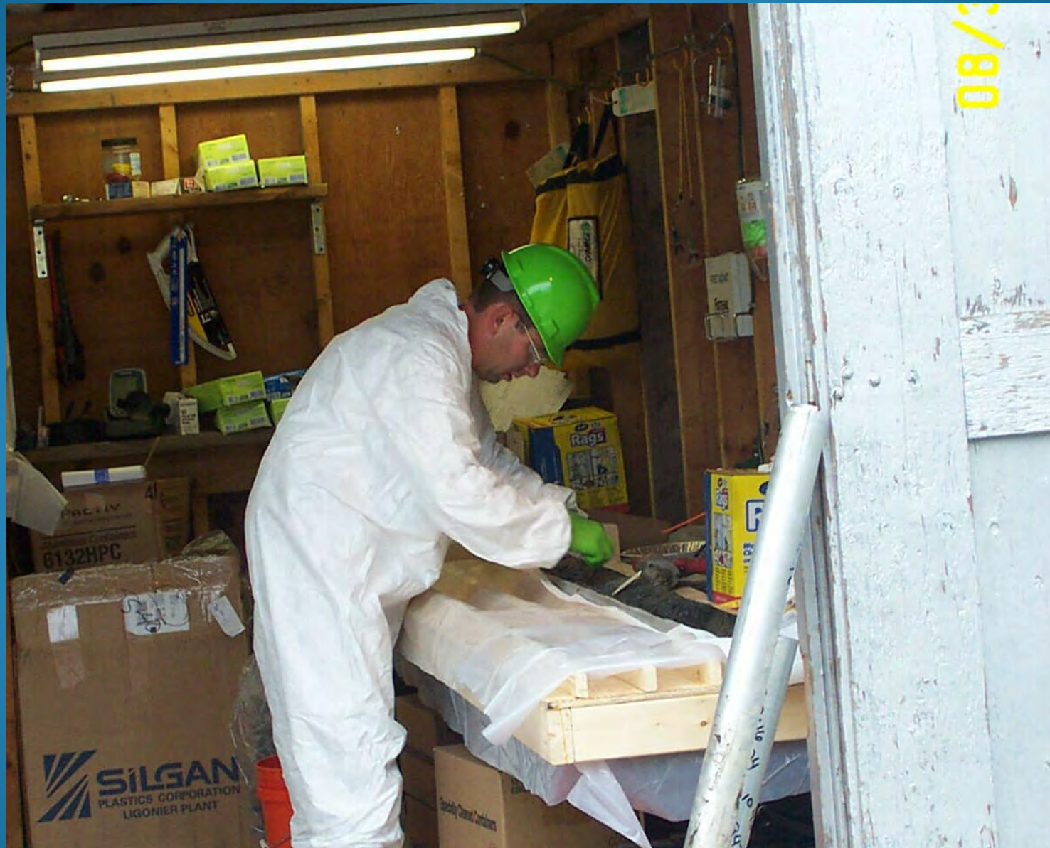
Sediment core processing