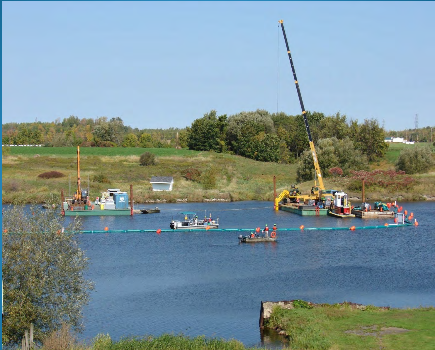
2006 Activated Carbon Pilot Study