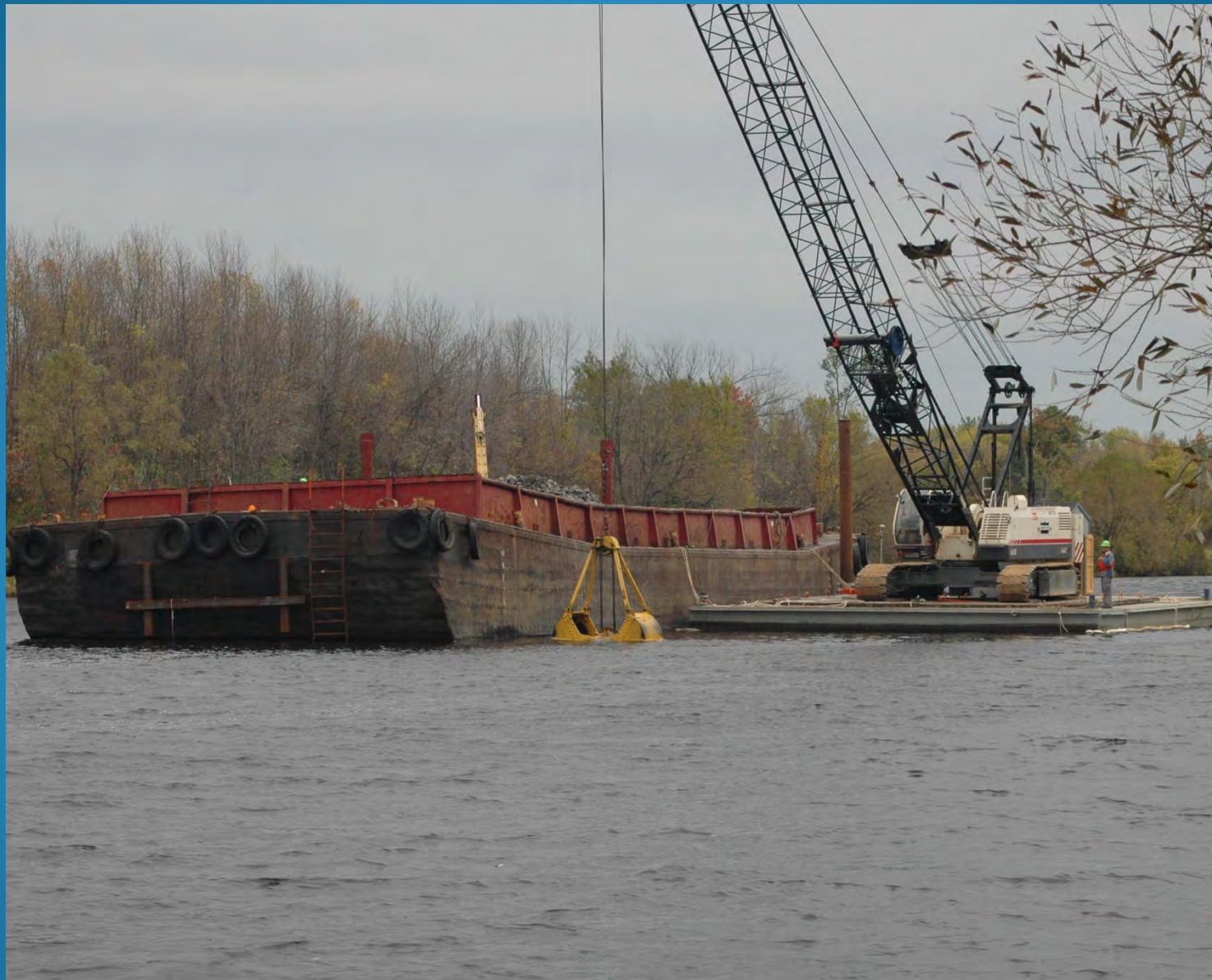
2005 Remedial Options Pilot Study – armor stone placement