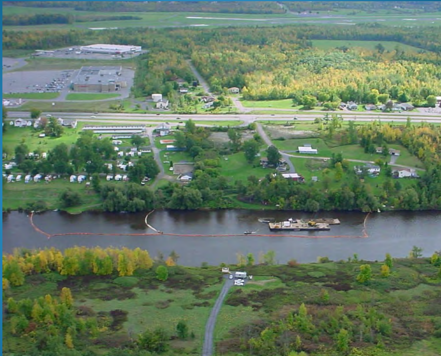
Aerial view of 2001 Capping Pilot Study