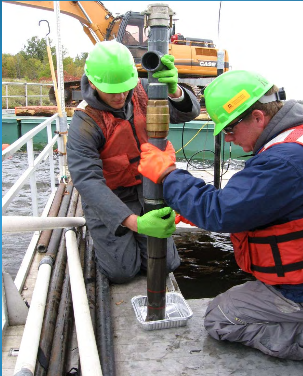
Sediment Core Collection