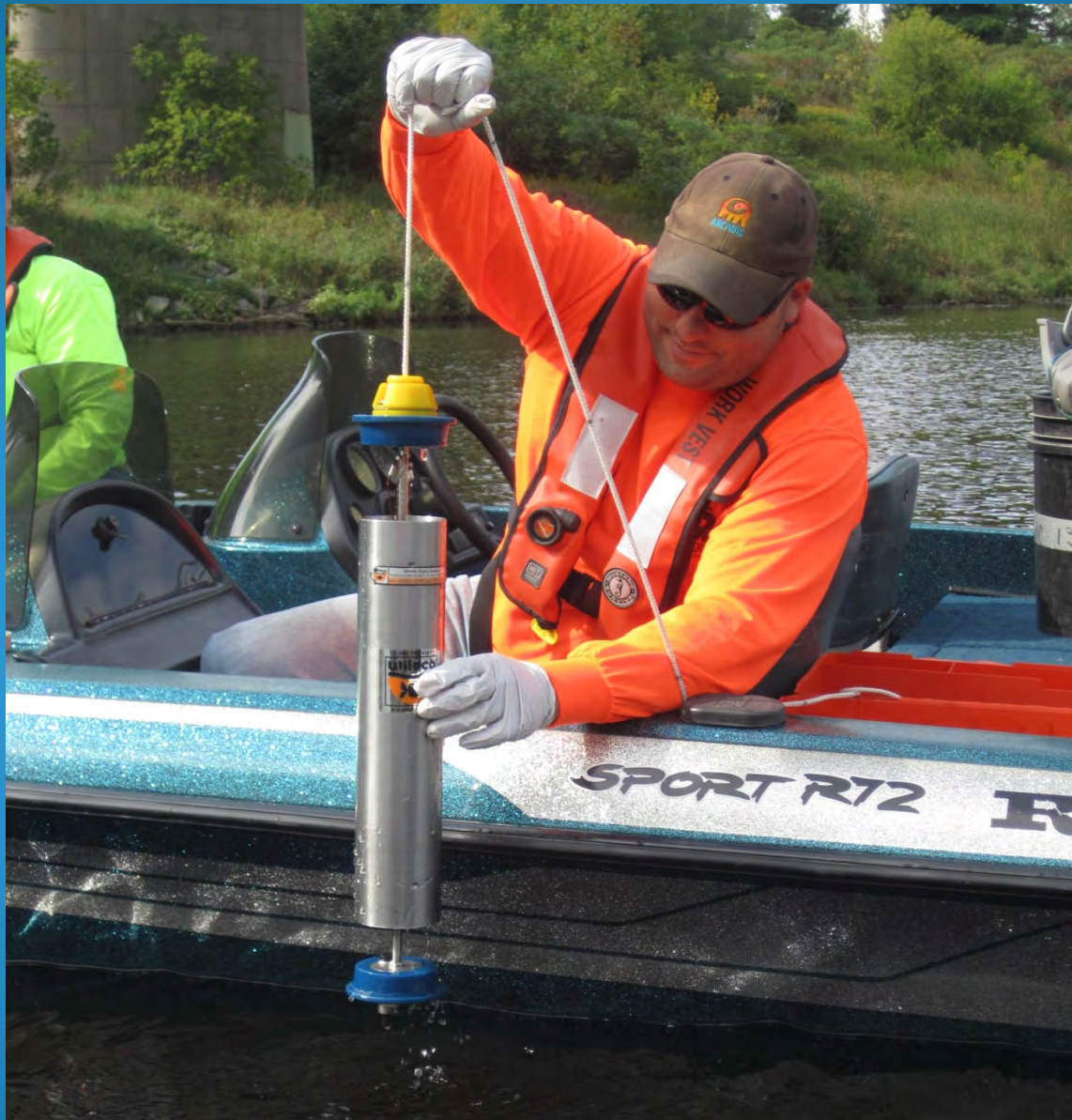
Water column sampling