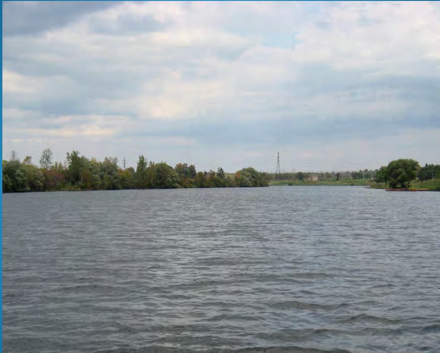
Lower Grasse River – view from boat