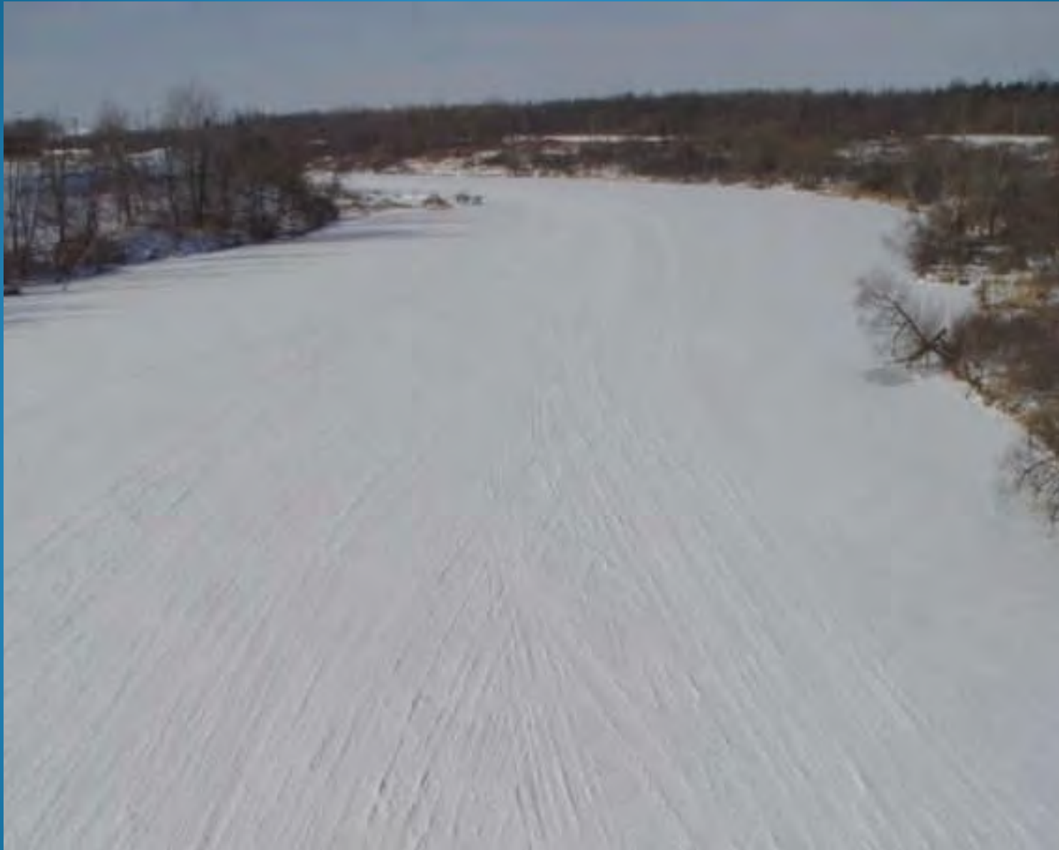
Lower Grasse River – view from bridge