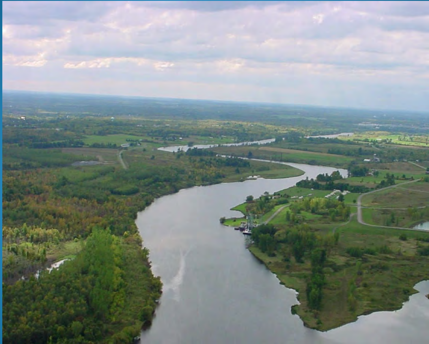
Lower Grasse River – looking upstream from the mouth