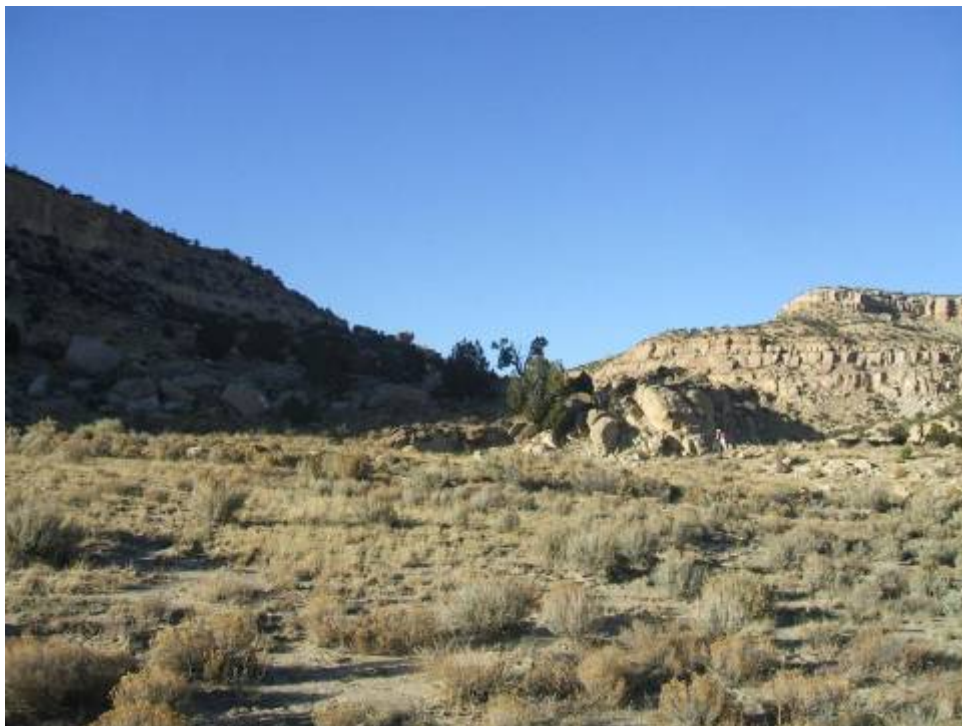
Photo 2. Church Rock ISL mine site, towards the north