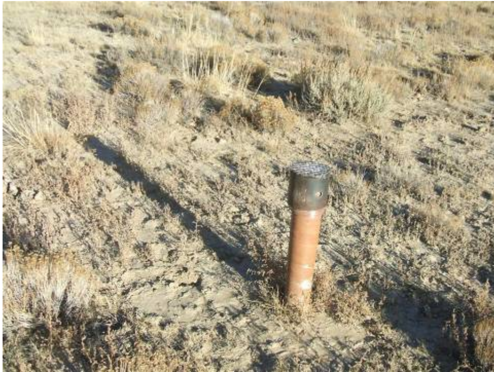
Photo 5. ISL monitoring well surrounding the mine site, towards the east