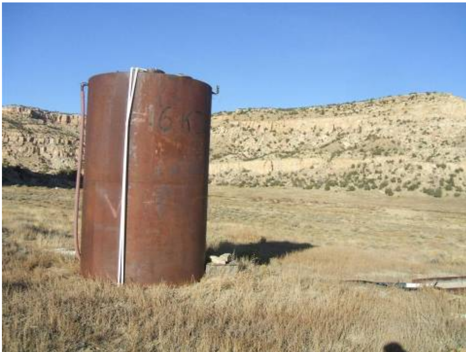
Photo 4. Water tank and feeding trough south of the mine site, towards the north