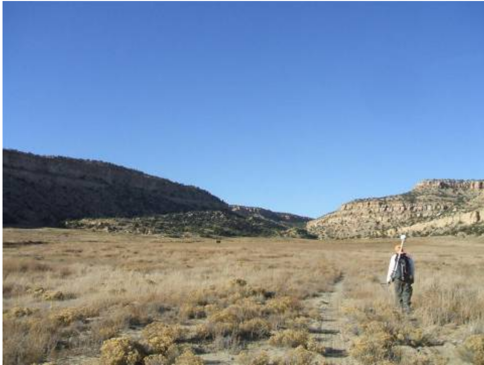
Photo 1. Church Rock ISL mine site, towards the northwest