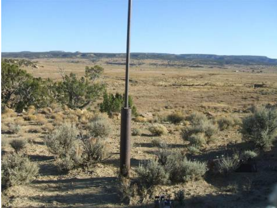
Photo 3. Metal pipe and well within the southern portion of the mine site, towards the southeast