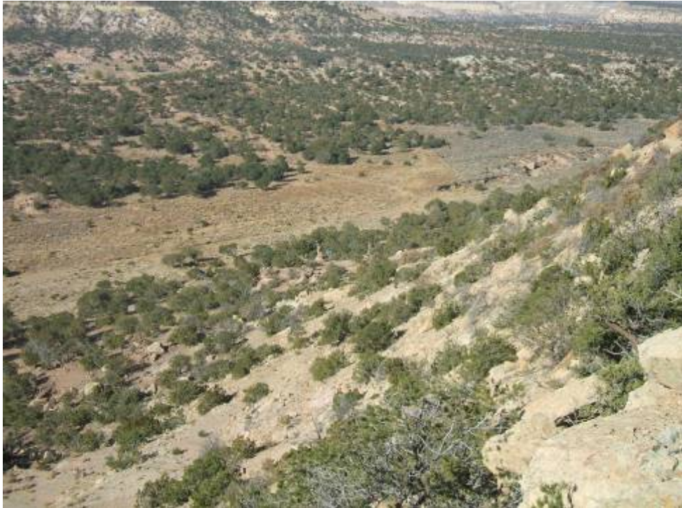
Photo 1. Mine site, from top of cliff area, towards the southwest