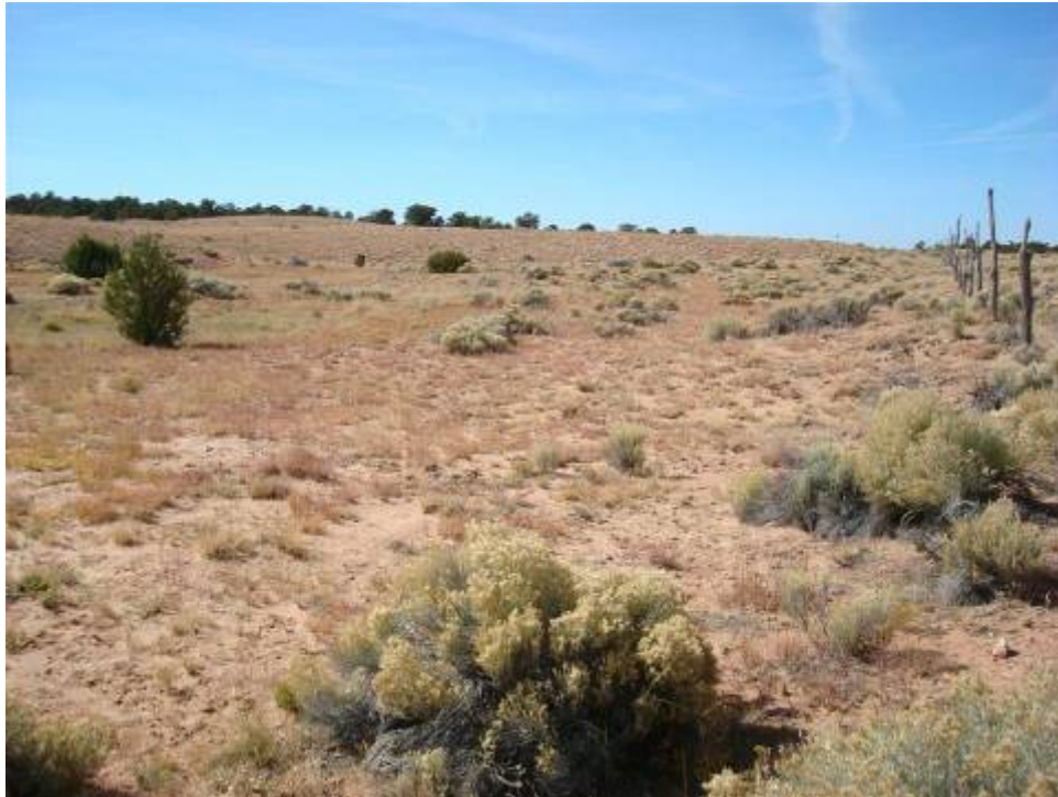
Photo 3. Nanabah Vandever Mine site, suspect covered waste piles