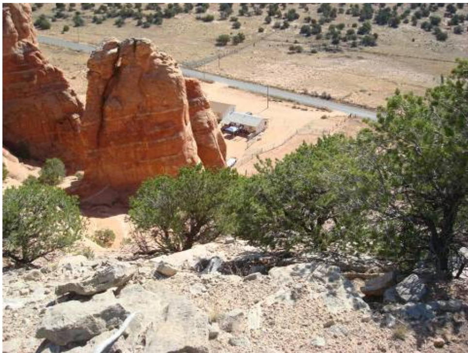
Photo 6. Nanabah Vandever Mine site, view of church from mine