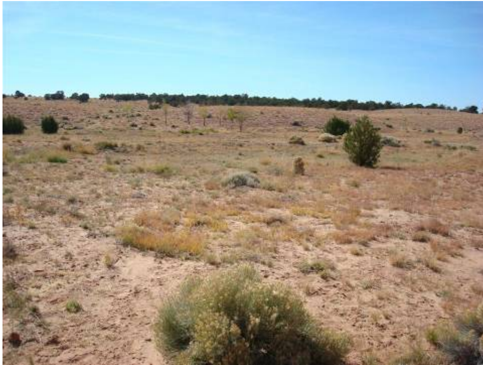
Photo 1. Nanabah Vandever Mine site, towards the south