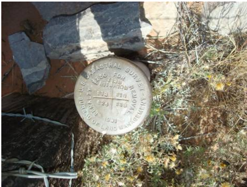
Photo 2. Nanabah Vandever Mine site, section corner survey marker