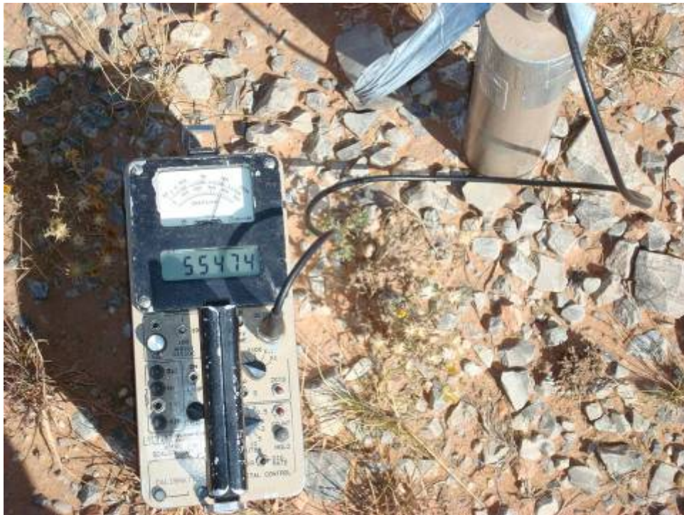
Photo 4. Nanabah Vandever Mine site, waste rock emitting gamma radiation